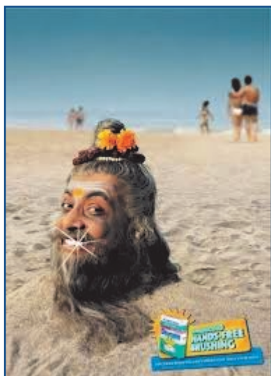
Figure 4 : A Daygum Advertisement Showing a Sadhu Buried in Sand