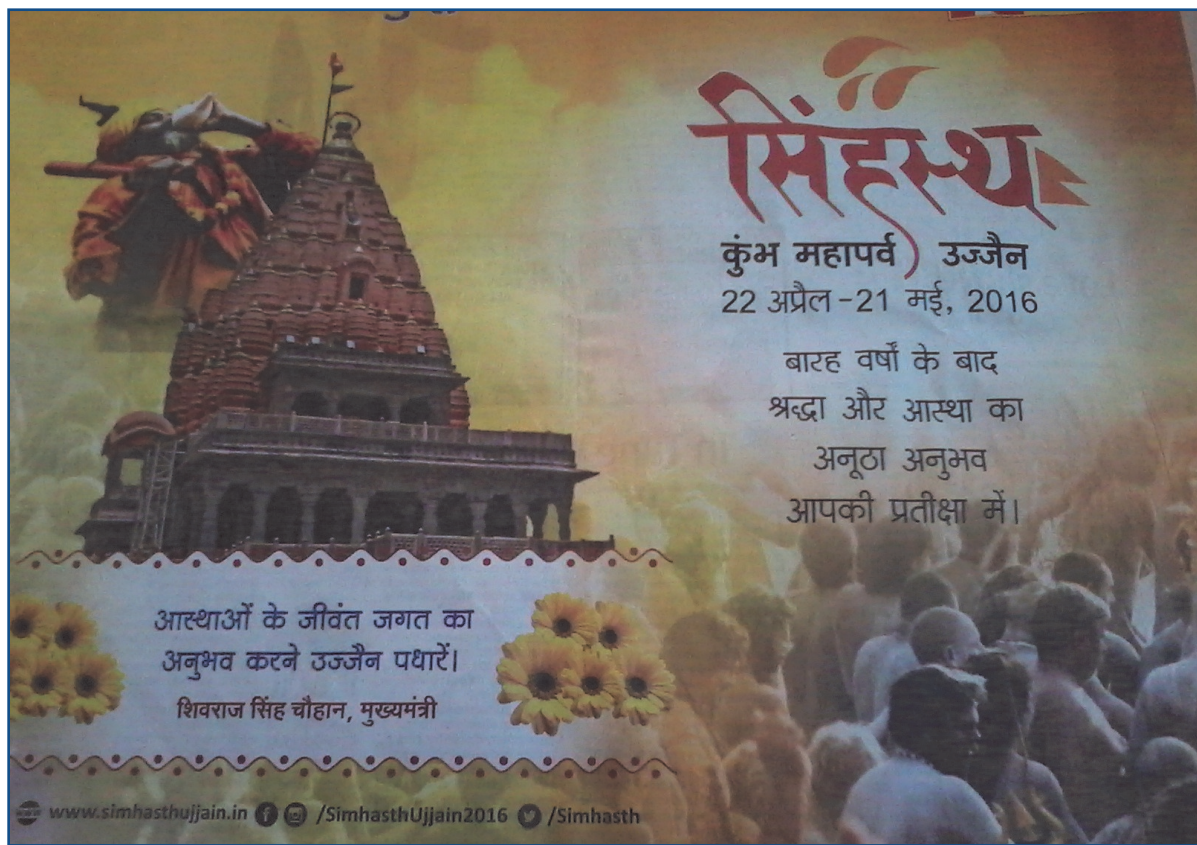
Figure 2 : Government Advertisement in Hindi Announcing Simhastha Kumbh Mela Dates

The Uttar Pradesh government has its own formula for communal harmony through pilgrimage. It has chalked out a plan to take a group of Hindus and Muslims on a joint pilgrimage to Pushkar and Ajmer in Rajasthan. The UP government has been marketing the initiative as a first-of-its kind step. This, too, betrays a lack of foresight. After all, the twin cities of Ajmer and Pushkar have always been a composite sacred site. While Hindus visit the Ajmer dargah , Muslims take part in the mela . In its enthusiasm to promote sponsored pilgrimage as a step towards communal harmony, the state government is hinting at a divide that never existed in reality.