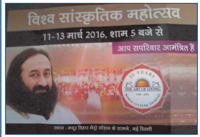
Figure 1 : One of the Advertisements Announcing Sri Sri Ravi Shankar's Grand 2016 Event

political forces are more concerned about ensuring the pilgrims' safety rather than reviewing a disastrous developmental strategy. The pilgrimage-related economy is important for the state, no doubt. In 2010, the BJP had urged the then Congress-led central government to allot 250 MW of power for the Char Dham pilgrimage. Later, the then Congress chief minister, VK Bahuguna, stopped the declaration of eco-sensitive zones, claiming that it would adversely impact employment opportunities. Clearly, media was right in highlighting the vested political interests. Yet, the fact remains that local concerns were swept under the carpet. The tragedy of the local people, particularly farmers at the receiving end of a discriminatory land acquisition process, and the plight of poorer residents of remote areas who are dependent on the pilgrimage economy failed to find a voice in the media, which instead, focused on the plight of the stranded pilgrims - playing into the hands of a political class that wanted the focus to be shifted from the people of the state. In fact, the focus on stranded pilgrims enabled the right-wing forces to consolidate their political constituency.