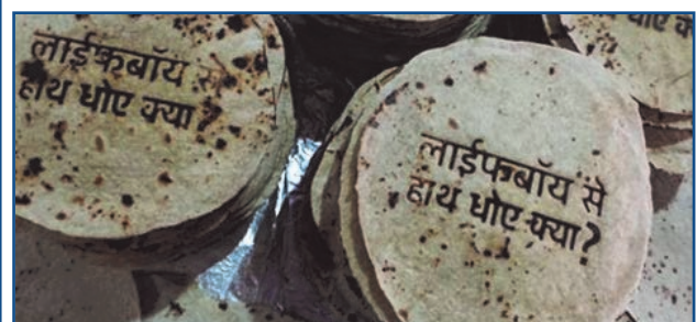
Figure 9 : Roti Reminder Campaign at Kumbh Mela Which Won Several Awards

Can a woman be a maulana (Muslim religious scholar) and call the faithful at Delhi's Jama Masjid to pray? Can we have a female archbishop (in Delhi we have