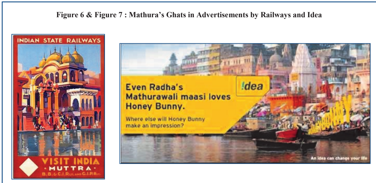
Figure 6 &amp; Figure 7 : Mathura's Ghats in Advertisements by Railways and Idea

The digital world, too, has transformed communication patterns. Now you have Speaking Tree , the spiritual and wellness supplement of The Times of India as an app on your mobile phone, and can listen to Soul Yatra on an FM radio station. Despite their asceticism, sects, known as akharas , [11] are moving with the times. Leaders of akharas taking part in the Kumbh Mela have Facebook pages. Some gurus advertise on billboards and posters to attract followers, others chat on mobile phones. There is no hotline to God as yet, though.