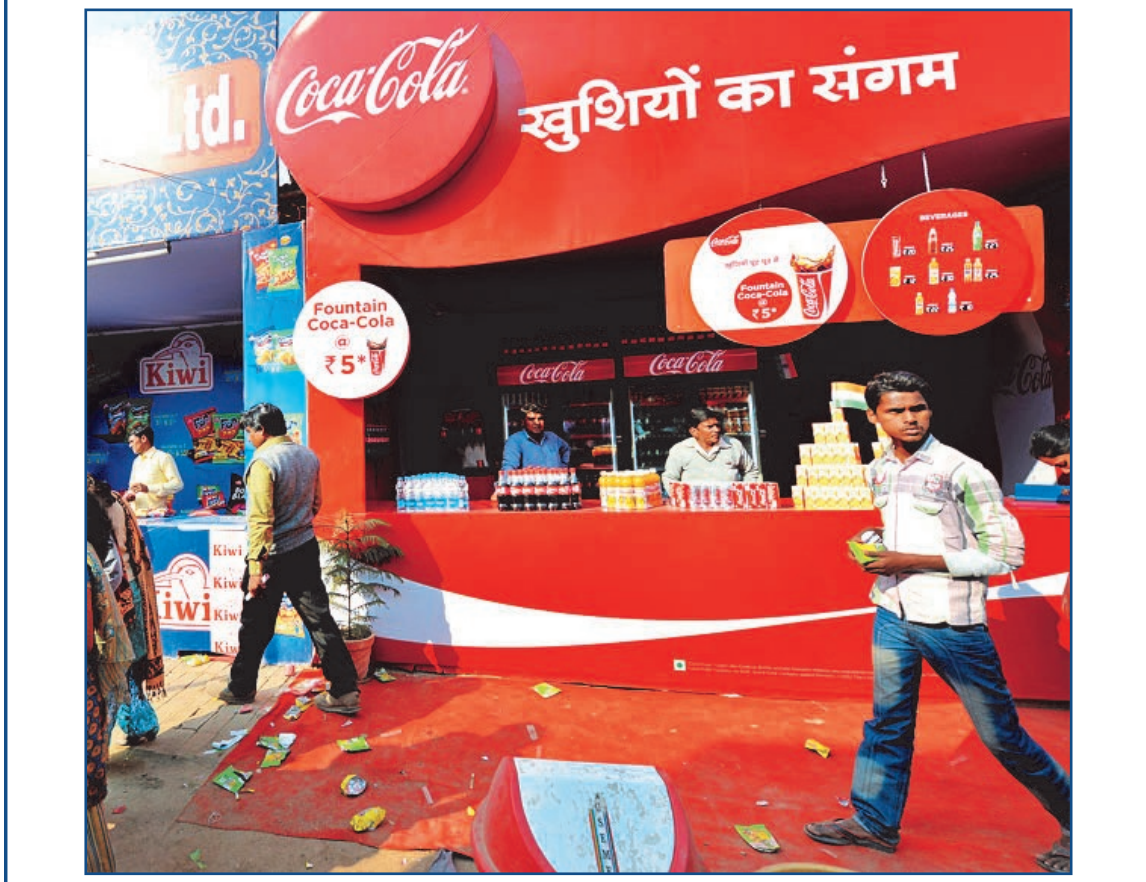
Figure 8 : Coca Cola's Marketing-media Campaign for 2013 Kumbh Mela Punned on 'Sangam'

According to Piyush Pandey, the man behind the campaign, the greatest success of his team in recent years has been the 'Kumbh Mela Lifebuoy Roti Reminder':