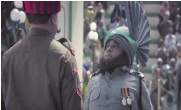
Figure 3 : A Still from the Fevikwik 'Todo Nahin, Jodo' Advertising Campaign

bond) advertisement campaign on India and Pakistan beating the retreat event at Wagah-Attari border as being disrespectful to the nation's collective memory of the Partition. However, the young and upwardly mobile Indian consumers seem to find the advertisement humorous.