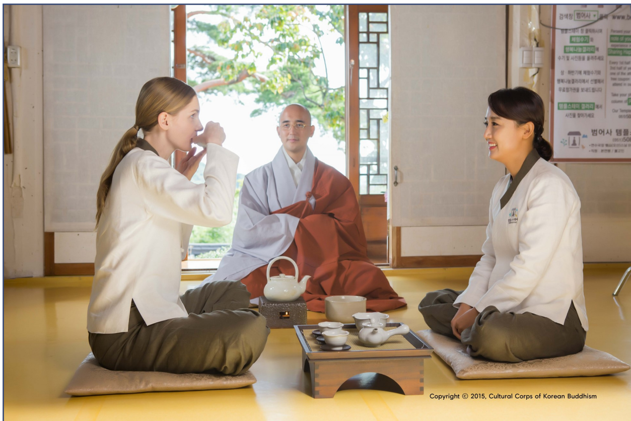
Figure 3 : Promotional Image—Korean Templestay