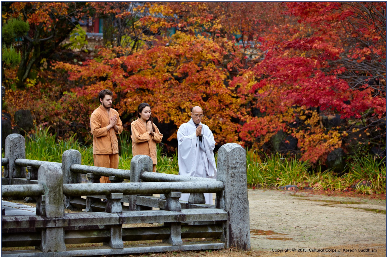
Figure 3 : Promotional Image—Korean Templestay