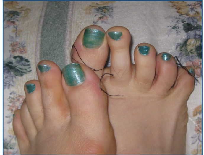
Blisters become part of, perhaps a badge of, the standard 'no-pain: no-gain' ethos of many contemporary pilgrimages; what is being 'gained' is up for existential grabs.