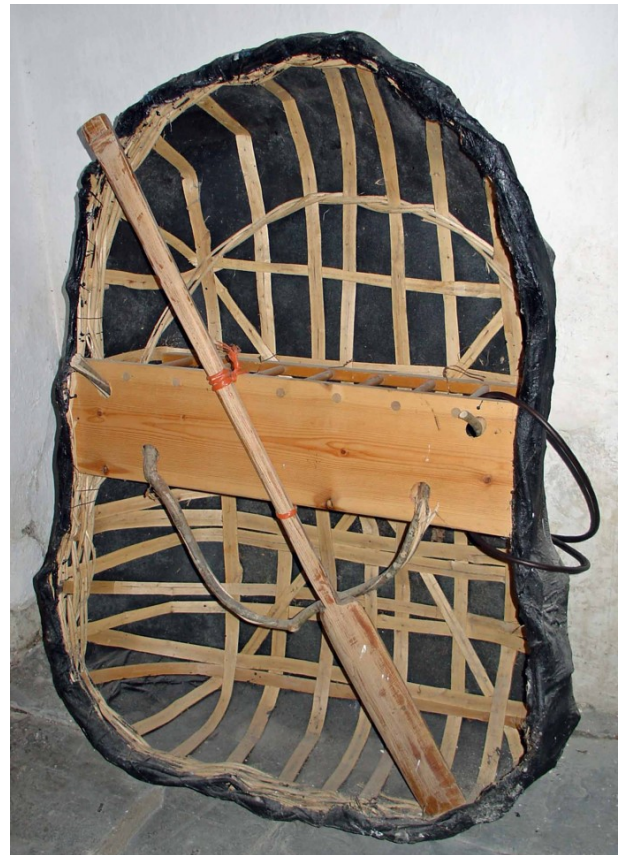
Figure 3: Coracle and paddle, typical River Teifi design, displayed in Manordeifi Old Church Manordeifi, Pembrokeshire, Wales.

Coracles of similar design have been used since, and continue to be used to today in Ireland and the British Isles, as well as in South and Southeast Asia.