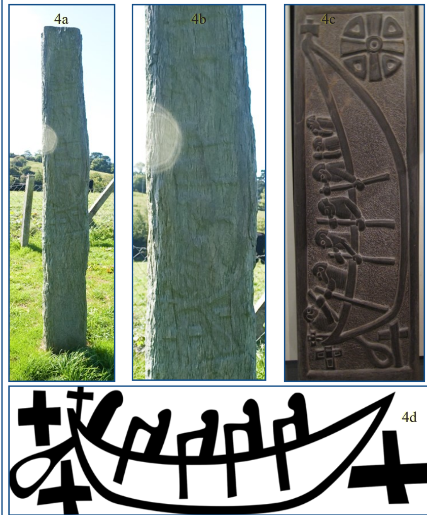
Figure 4 A remarkable and unique contemporary image of a boat on the Kilnaruane Pillar Stone, in southwestern Ireland.

Notes: The remaining shaft of a high cross, this stone presents a carving of Ss Anthony of Egypt and Paul of Thebes. It was certainly erected in a monastic context and the boat and rowers may indeed portray peregrini. (Images: far left, the remaining pillar stone, middle an enlargement showing a faint outline of the boat, right a restored version of the same panel, below a graphic schematic of carved boat, rowers and crosses.)