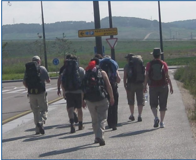
Pilgrims on the Camino de Santiago in northern Spain.