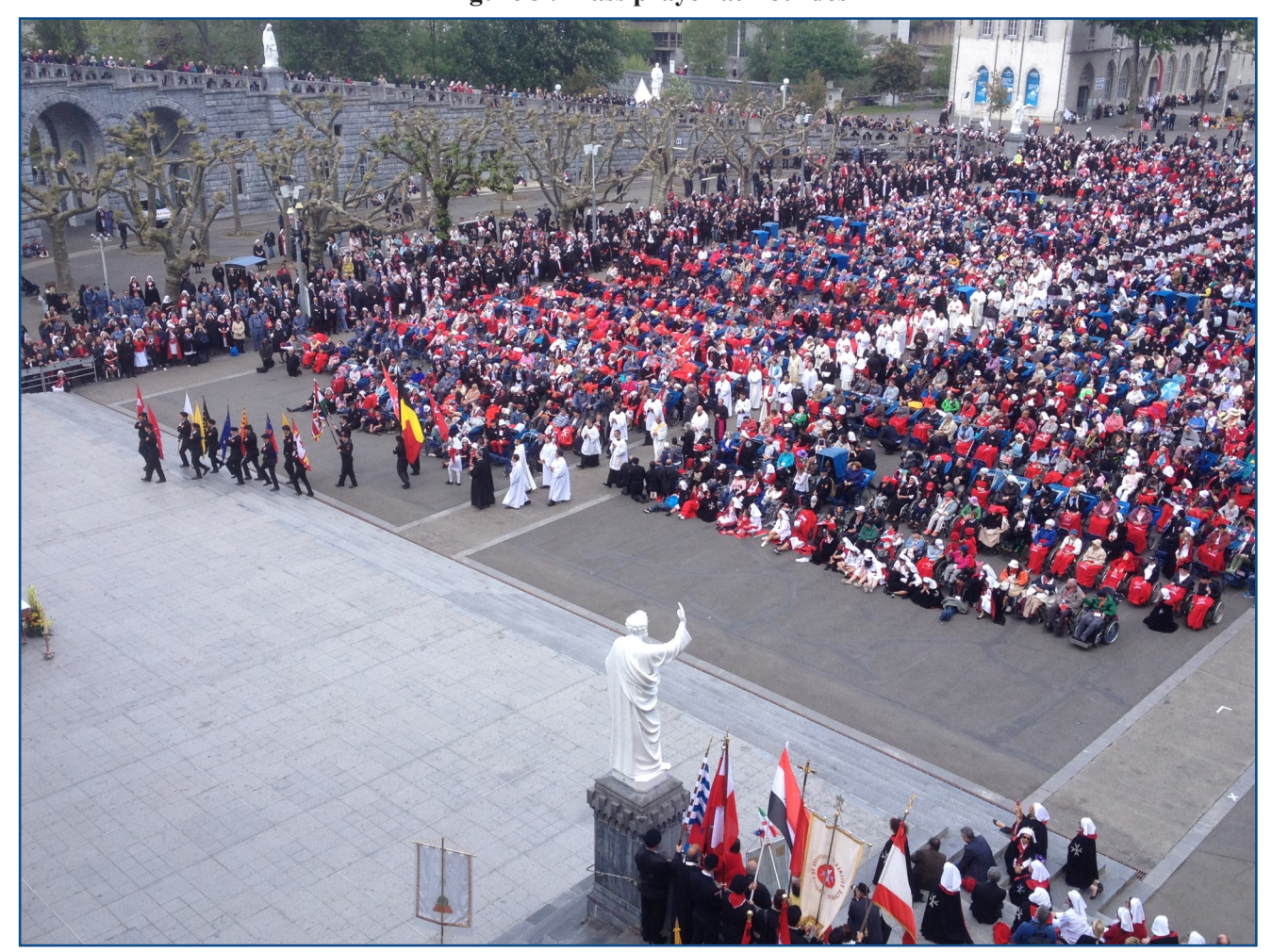
Figure 5: Mass prayer at Lourdes

Pilgrimage to the great shrines of Europe and Jerusalem always contained - inevitably - an element of tourism, because it partly depended on an existing 'hospitality' infrastructure for travel, food and shelter. Later commentators were also not in favour of pilgrimages, e.g. the German Franciscan Berthold of Regensburg (c. 1220-1272), is rather cynical about the whole essence of pilgrimage, writing that 'those who make lots of pilgrimages are seldom sanctified by it'. David Hume and Erasmus did not agree with the institutionalising of miracles by the Church and clergy