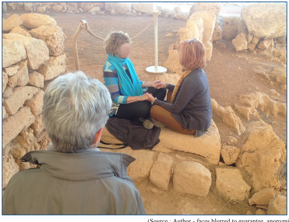
Figure 3: NRM adherents enjoying the energy and vestiges of the Neolithic temples at Malta