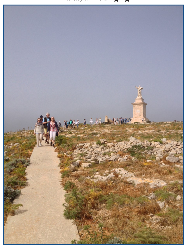
Figure 1: Walking down the path at St Paul's Island, Malta, while singing