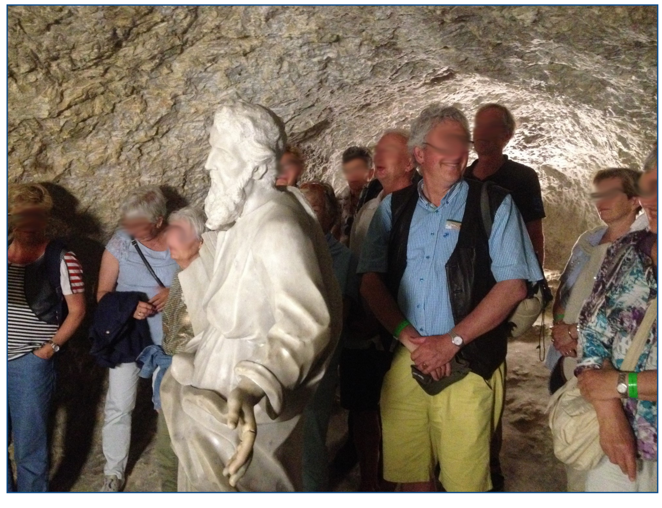
Figure 2: Praying at St Paul's Grotto, Rabat, Malta,

Pilgrims hold the statue of St Paul while singing, praying and enjoying having their picture taken with St Paul. These were Protestants, discovering that statues and pilgrimage were not such bad things after all