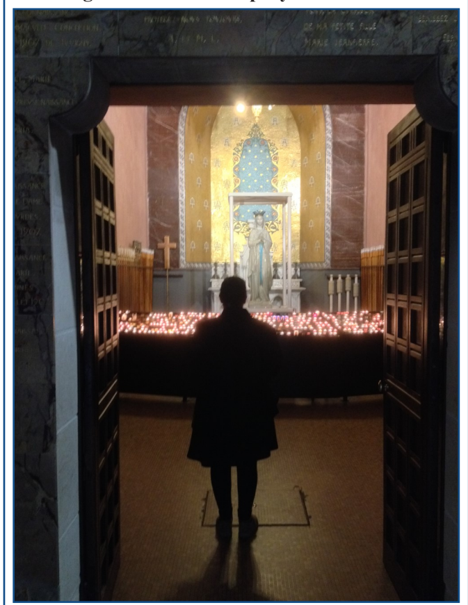
Figure 6: Individual prayer at Lourdes

Increasingly, modern people, stressed as they may be from their work or environment, are exploring alternative solutions to seek some human essentials. Akin to pilgrimage, the NRM participants are there for the expectation or an experience of the mystical, seeking fulfilment in the widest sense, such as healing or initiatory experience, harmony with Nature, spiritual engagement or (re)discovering whatever their faith was (Simos, 2001; Scott, 2010). What they do not posses in their beliefs are religious guilt, austerity and suffering—which elements often belong to the traditional Christian pilgrimage package. Some of the participants experience a visit to Malta in the sense of diaspora tourism, as a homecoming to their spiritual roots