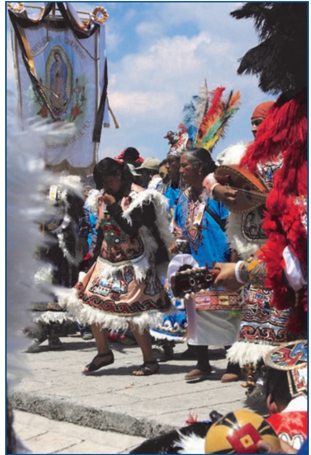
Figure 1: Pre-Hispanic dances in Mexican Catholic Festivities

Ethnography, of anthropological origin, is a qualitative method that allows the analysis of complex social phenomena that develop in micro environments. It is defined as the description and analysis of daily activities to understand the universe of senses and the logics of social actions, revaluing the need to understand 'other'. The knowledge of human diversity, gathered directly from fieldwork, allows the researcher to construct generalisations, always heuristic, of social reality (Guerrero, 2002).