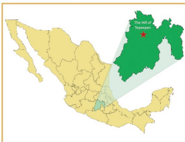
Figure 2: Location of the Hill of Tepexpan

Santa Cruz Tepexpan, a community that belongs to Jiquipilco Municipality, in the State of Mexico, shelters the Sanctuary of the Lord of the Hill and other constructions that date back of different epochs. From pre-Hispanic times it constitutes a place of worship linked to nature and is considered 'the sacred mountain' of the mazahua people (Hernández, 2008). The two festivities that are celebrated in the sanctuary