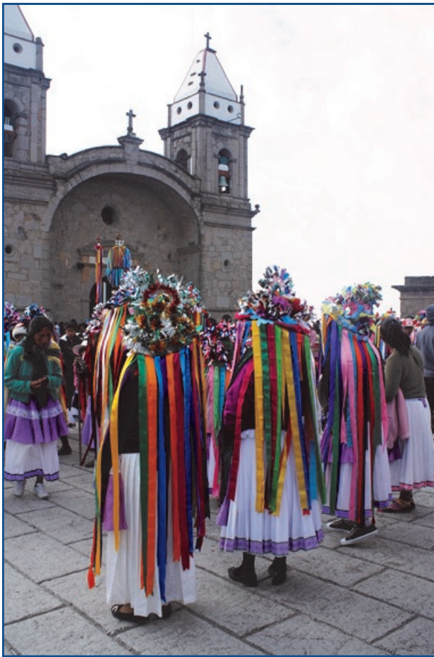
Figure 4: Traditional Pilgrimage Dancers