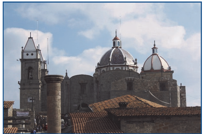
Figure 3: The Sanctuary of the Lord of the Hill