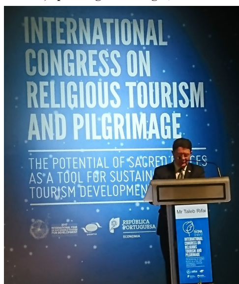
Figure 2 : UNWTO recognition for Religious Tourism and Pilgrimage - Mr Taleb Rifai (Secretary General, UNWTO) speaking in Portugal, November 2017

As can be seen in the discussion above, Religious Tourism and Pilgrimage are substantial motives for the global movement of people. Whether this travel is for purely religious motives, or whether pilgrimage is influenced by some secular desires, or even if the journey is undertaken for entirely profane motives is not being discussed in this reflection. The main issue being highlighted here is the breadth and intensity of this form of religion-linked travel, which goes largely