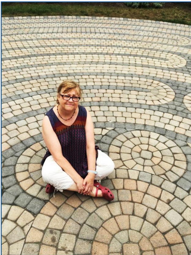
Figure 1: The Author at the labyrinth in Chatham, Cape Cod, Massachusetts

Key Words: pilgrimage, body, theorising pilgrimage, mindbody, mind-body, Christian, post-Christian, post-modern, Badiou, Poteat, topography, mobility, narrative, Eade, Sallnow, Ricoeur, embodied religion, communitas , embodiedness, transcendence.