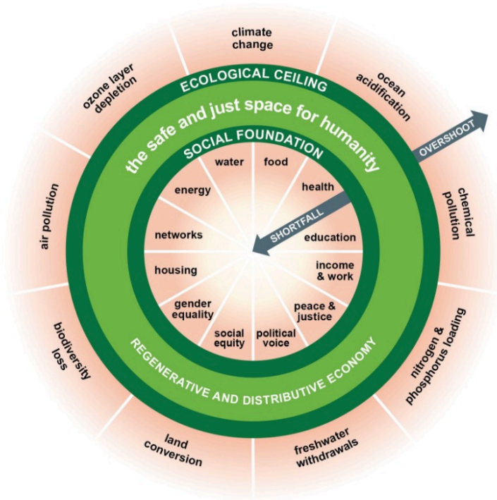
Figure 1: Doughnut of social and planetary boundaries.

EWB-UK has embraced the UN’s Sustainable Development Goals as core principles guiding its efforts (see Figure 2) and the team will also consider which of the SDGs figure prominently in interview narratives.