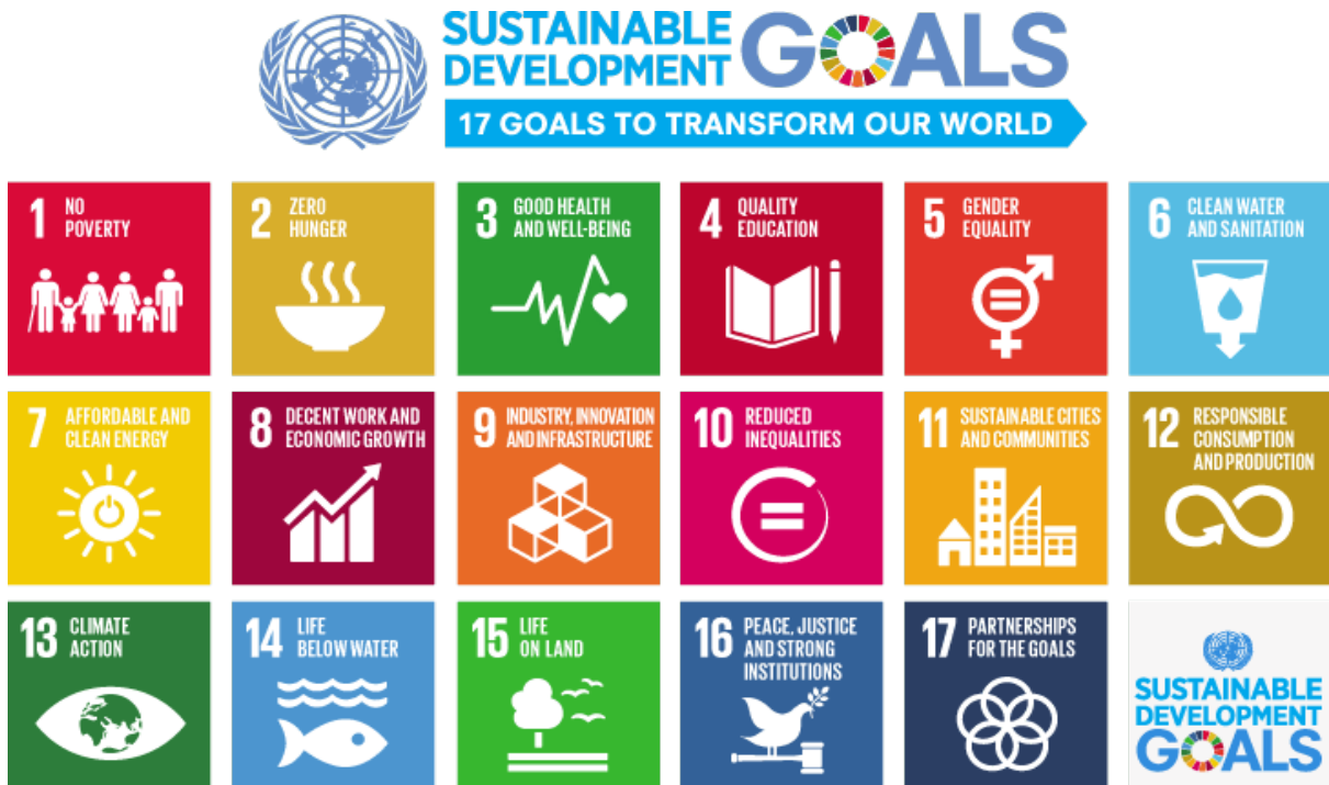
Figure 2: Sustainable Development Goals.

EWB-UK has embraced the UN’s Sustainable Development Goals as core principles guiding its efforts (see Figure 2) and the team will also consider which of the SDGs figure prominently in interview narratives.