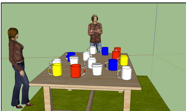
Figure 3: The table scene as seen by Participant 2.