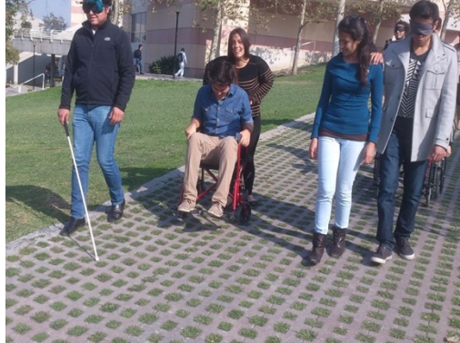
figure 8: Practical awareness experience at the multidisciplinary workshop. Monterrey –México.