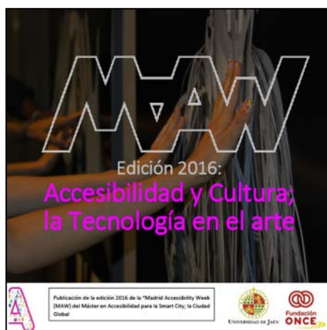
figure 7: MAW 2016 Publication: Accessibility and Culture; Technology in art

http://publicaciones.unia.es/busqueda-por-anno/item/madrid-accessibility-week-turismo-tecnologia-y-accesibilidad-edicion-2015