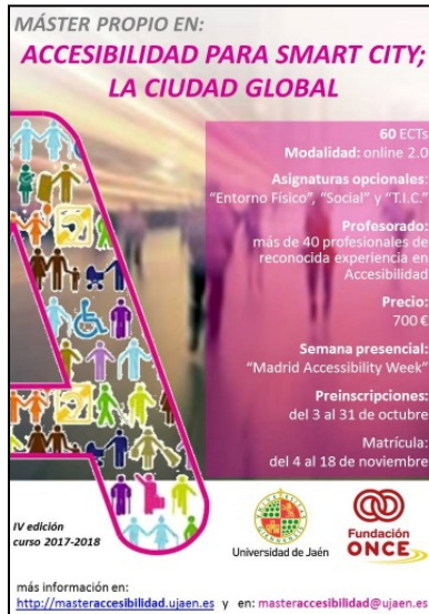
figure 4: Poster from the 4th edition of the Master's Degree in Accessibility for Smart City; the Global City, from the University of Jaen, sponsored by the ONCE Foundation.