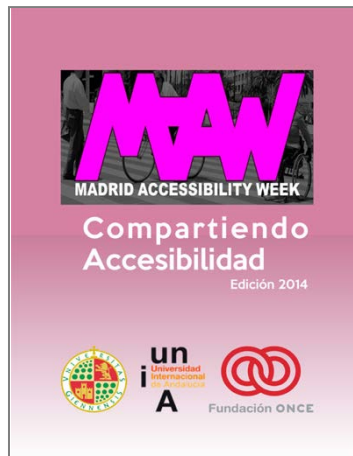
figure 5: MAW 2014 Publication: Sharing Accessibility

http://publicaciones.unia.es/busqueda-por-anno/item/madrid-accessibility-week-edicion-2014