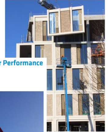
First Steel added for Performance Hall in East Quad