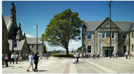
Central Quad Progress Continuing

Work-in-progress: we welcome your responses!