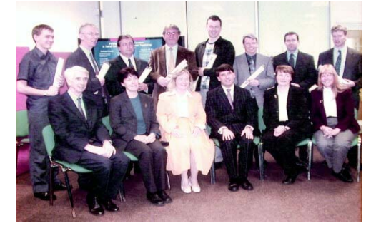
From workshops to accreditation: the first graduating class (2001).

In January 2009, both elements were drawn together and a single Learning, Teaching & Technology Centre was established. The aim of the centre is to develop, support and facilitate good teaching & learning practices across the institute.