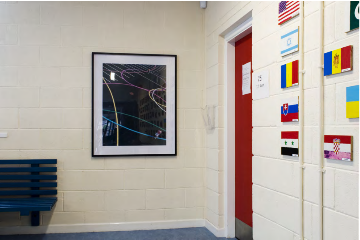
School Play View of permanent installation of photographs (each C-type print 112 x 90 cm) at Castleknock Educate Together School