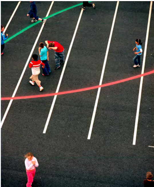
School Play #18(ii) (Second Series) (2008/11) C-type photographs, mounted on aluminium 66 x 64 cm. framed