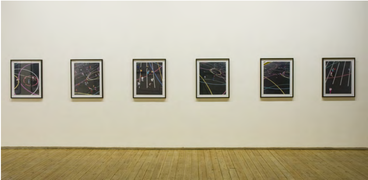
School Play, Second Series # 13(ii) – 18(ii) (2008/11) C-type photographs, mounted on aluminium 66 x 64 cm. framed Installation view: Green on Red Gallery