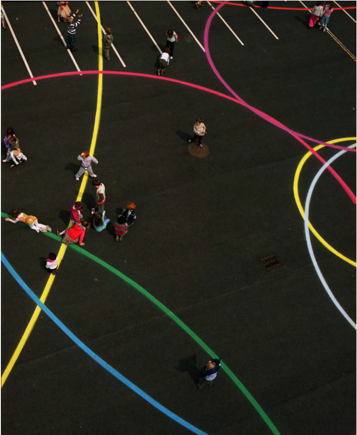
School Play No. 10 2008/09 C-type print 112 x 90 cm