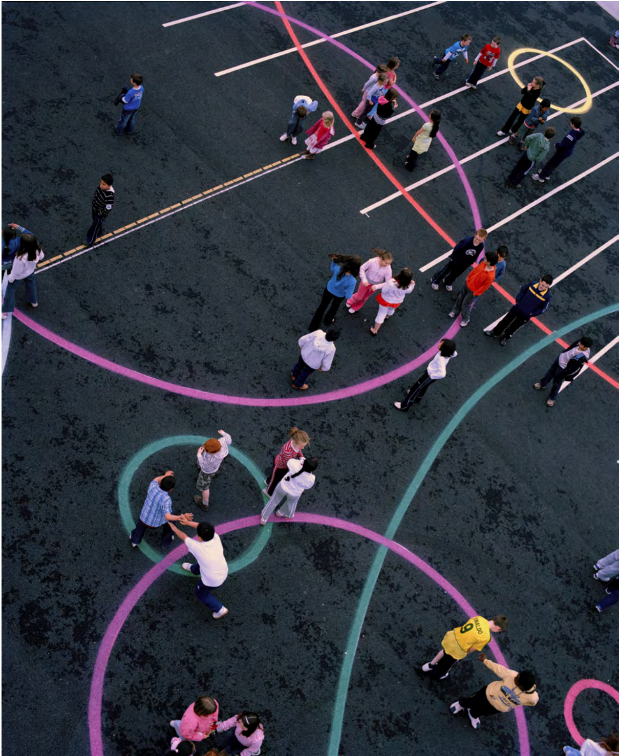
School Play No. 7 2008/09 C-type print 112 x 90 cm