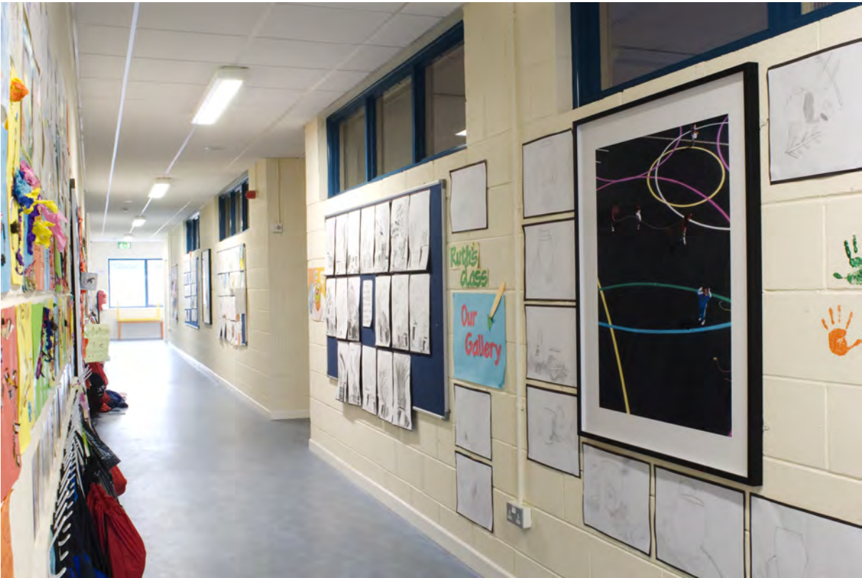
School Play View of permanent installation of photographs (each C-type print 112 x 90 cm) at Castleknock Educate Together School