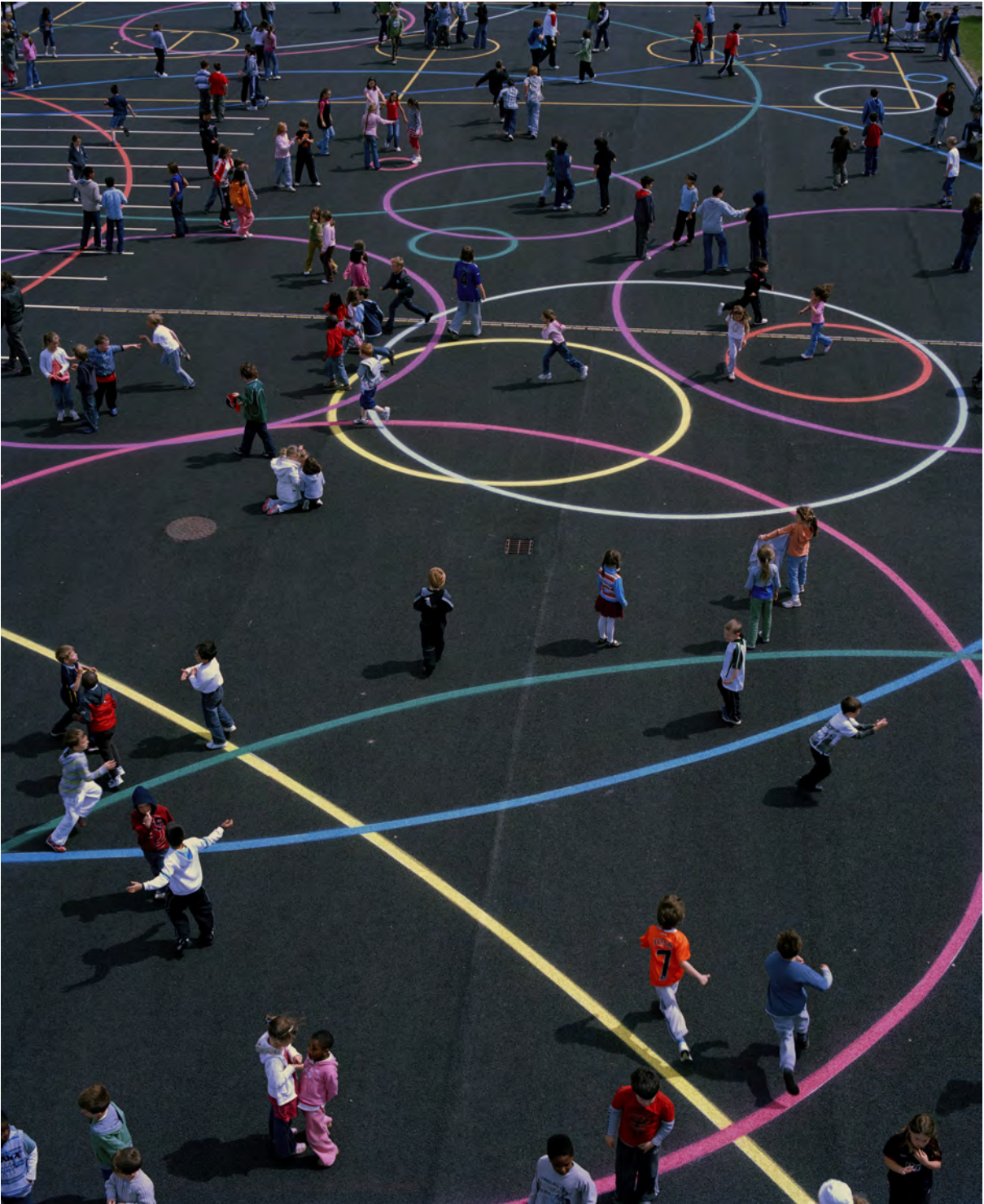
School Play No. 5 2008/09 C-type print 112 x 90 cm