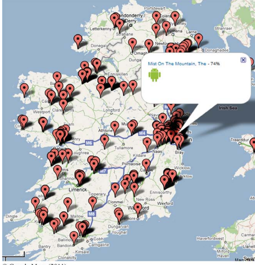
Figure 8. Geotagged Tunepal mobile QBP queries plotted on a Google map (see tunepal.org)

Note: See www.tunepal.org