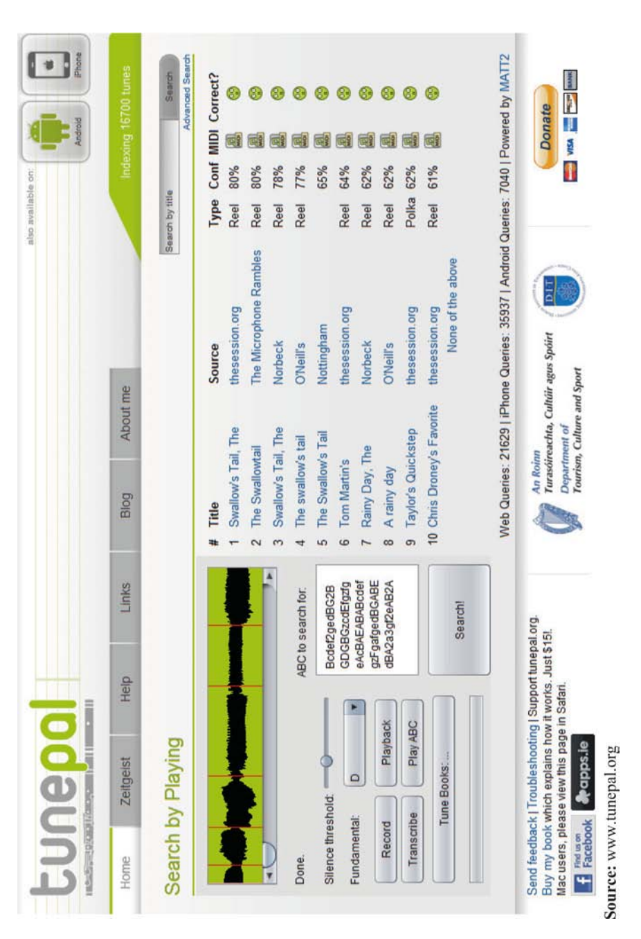
Figure 4. Performing a QBP search with the tunepal.org web site