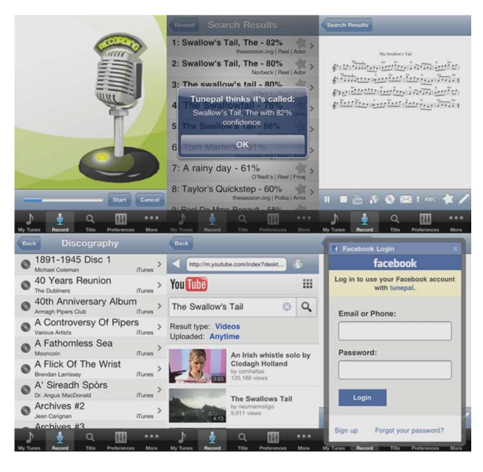
Figure 6. Screenshots of Tunepal running on an iPod Touch illustrating a typical workflow

Retrieved tunes are stored in a "My Tunes" section on the user's device, in order of most recently found to facilitate future retrieval for learning purposes. Playback is achieved using ABC2MIDI (Shlien, 2011) and the FMOD audio engine on iOS devices (FMOD, 2011). Android devices support MIDI playback natively. The Tunepal mobile apps also allow the user to switch the interface between Irish Gaelic (Figure 7) and English. The mobile versions of Tunepal have one major advantage over the tunepal.org web site and that is the ability for accurate geocoding of queries.