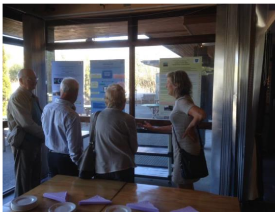
Figure 7: Members of the County Wexford Age Equality Network attending the feedback event in Wexford.

The event was attended by a number of members of the County Wexford Age Equality Network who took part in the Students in Action Project (figure 7).