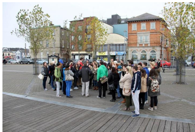
Figure 4: Students on a site visit in Wexford