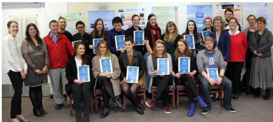
Figure 8: Students in Action Award Ceremony