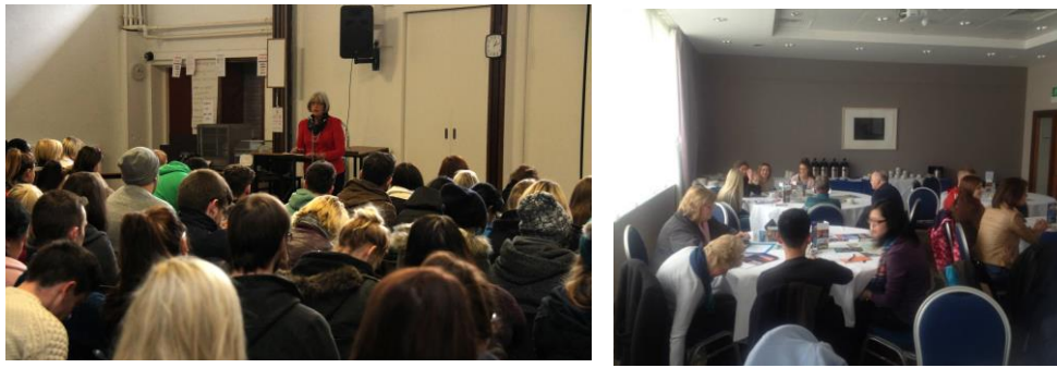
Figure 3: Student briefings by key stakeholders in Wexford