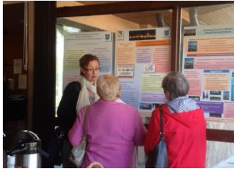
Figure 5: Poster presentation