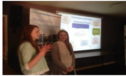
Figure 6: Students presenting their findings

The event was attended by a number of members of the County Wexford Age Equality Network who took part in the Students in Action Project (figure 7).