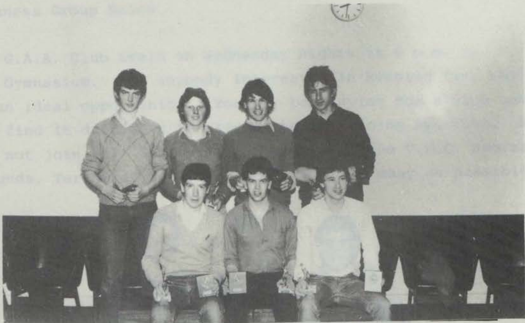
WRIT 2 BASKETBALL WINNERS OF THE LUNCHTIME LEAGUE

The College Guru will be in residence in the Gymnasium on Thursdays from 6 - 7 for beginners and 7 - 8 for the more advanced. No fee will be charged for the course.