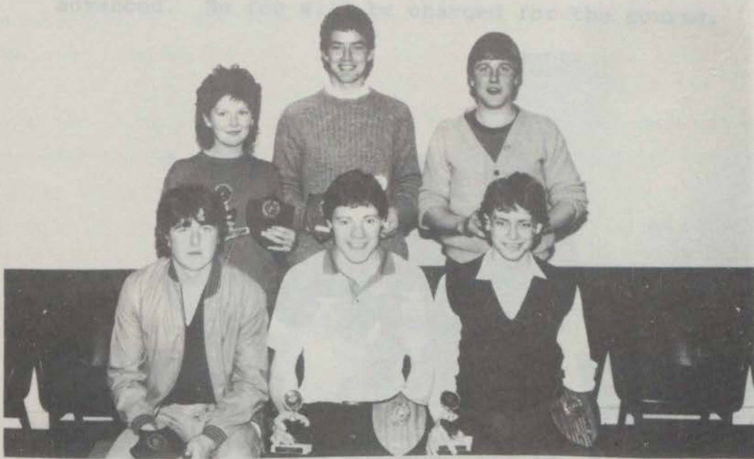
WSAD (3) VOLLEYBALL TEAM WINNERS OF THE LUNCHTIME LEAGUE

If you are interested, please fill in the Application form on last page and return to Seamus Byrne, in Room 153.