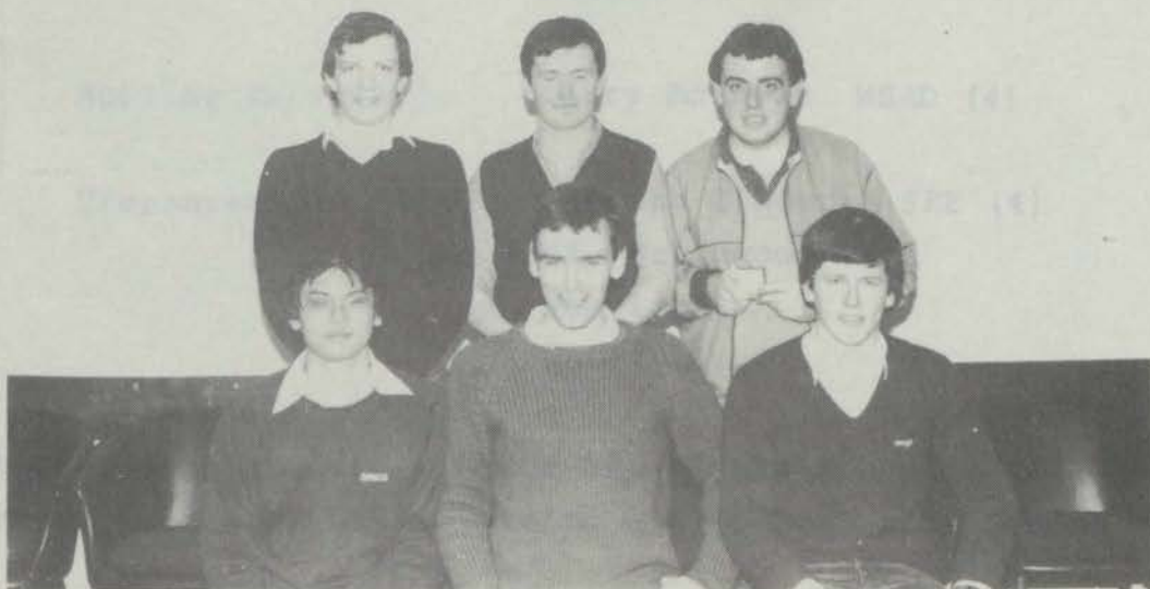
SEE (3) VOLLEYBALL and BASKETBALL LUNCHTIME LEAGUE

The G.A.A. Club train on Wednesday nights at 6 p.m. in the Gymnasium. For anybody interested in keeping fit, this is an ideal opportunity. You may be playing for a club team and find it difficult to attend their training sessions. Well, why not join us? Games will be played at the V.E.C. Sports Grounds, Terenure, and arranged to suit as many as possible.