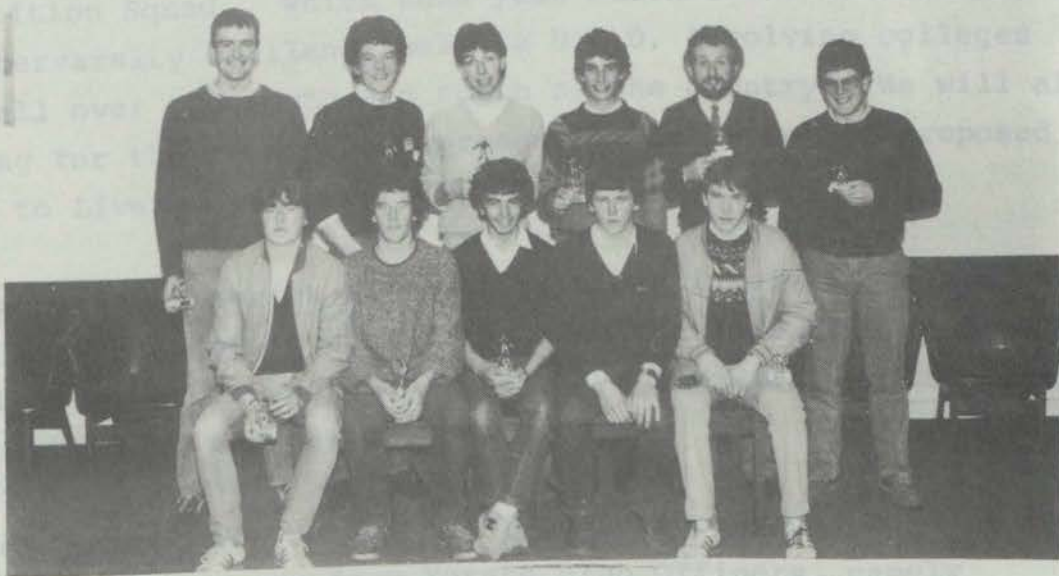
SEE (4) SOCCER TEAM WINNERS OF THE SATURDAY LEAGUE