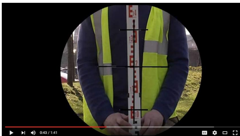
Figure 2: Observing an E-Type staff