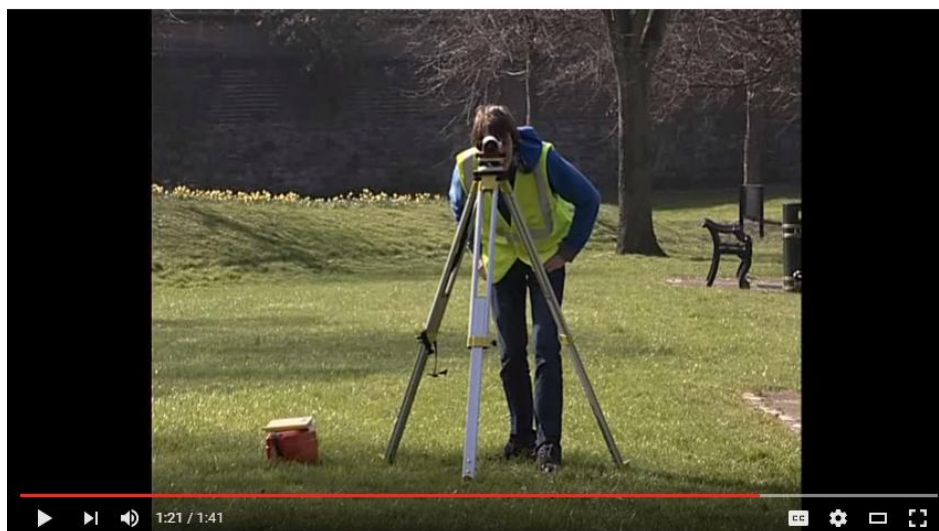
Figure 1: Levelling with an automatic level