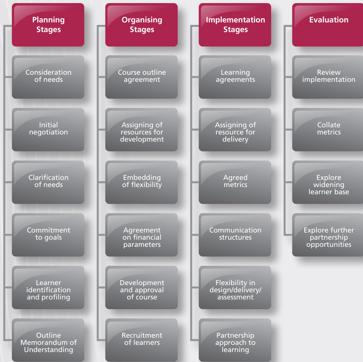
Indicative Analysis of Stages