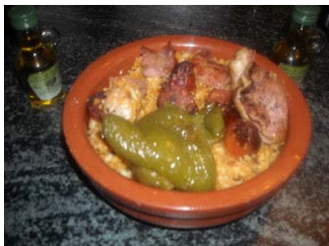
Serve the "migas" with the peppers, chorizo and rashers.

-Add the paprika, stir it and then add the breadcrumbs. Over low heat stir it well till the breadcrumbs absorb all the fat. Taste and season.