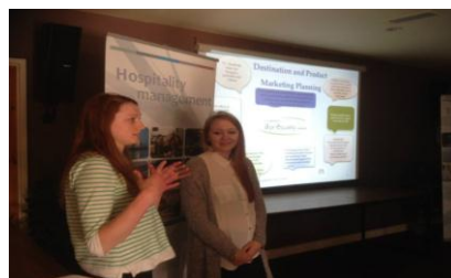
Figure 2.6: Students presenting their findings

The event was attended by a number of members of the County Wexford Age Equality Network who took part in the Students in Action Project (Figure 2.7).