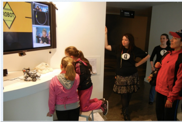
Figure 1: The LEGO NXT robot automated conversation platform, Herme, interacting with people and collecting multimodal conversational data in the Science Gallery at Trinity College Dublin

tention to one interlocutor. One computer controlled the robot, performed face tracking, sent and received data and displayed the robot's-eye view in real-time to participants, while another computer initiated a conversation and monitored participants' reactions in order to step through a pre-determined sequence of utterances.