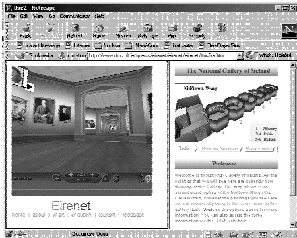
Fig. 2 – The National Gallery of Ireland

The interface for the National Gallery Model, which consisted of followed a similar layout with VRML on the left and HTML on the right. Visitors could either “walk” around as they wished or take a guided tour. This guided tour option linked with a Real Audio plug-in where visitors could listen to a tour guide talk in more detail about a particular painting. (Progressive Networks, 1997)