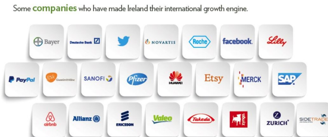
FIGURE 4 IRELAND'S WELCOMING OF FOREIGN DIRECT INVESTMENT