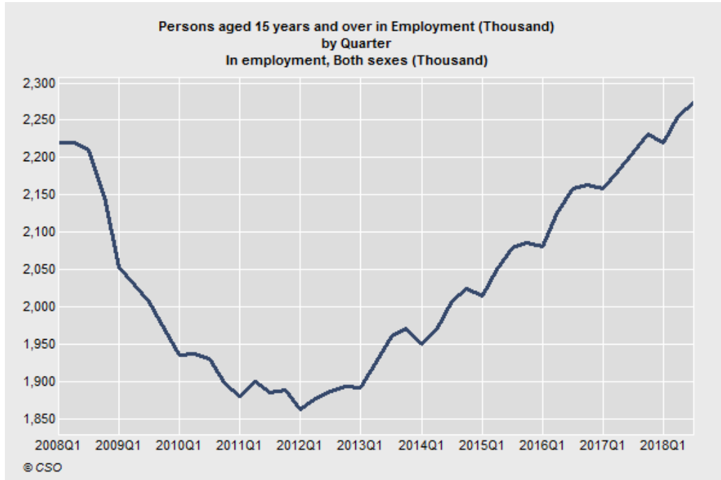
FIGURE 1 NUMBERS EMPLOYED IN IRELAND BY QUARTER 2008-2018.

Source and notes: Constructed from www.cso.ie data as downloaded 20190201. Employment is a good measure of the Irish economic performance: Given the high level FDI in Ireland results in problems with usual GDP measure that is generally used for international comparisons. Given the openness of the Irish Labour market, and discouragement of labour force participation as a downturn persists, unemployment figures are not as good an indicator as the employment numbers shown above. Since the labour market tends to lag the overall economy the period starts in 2008.