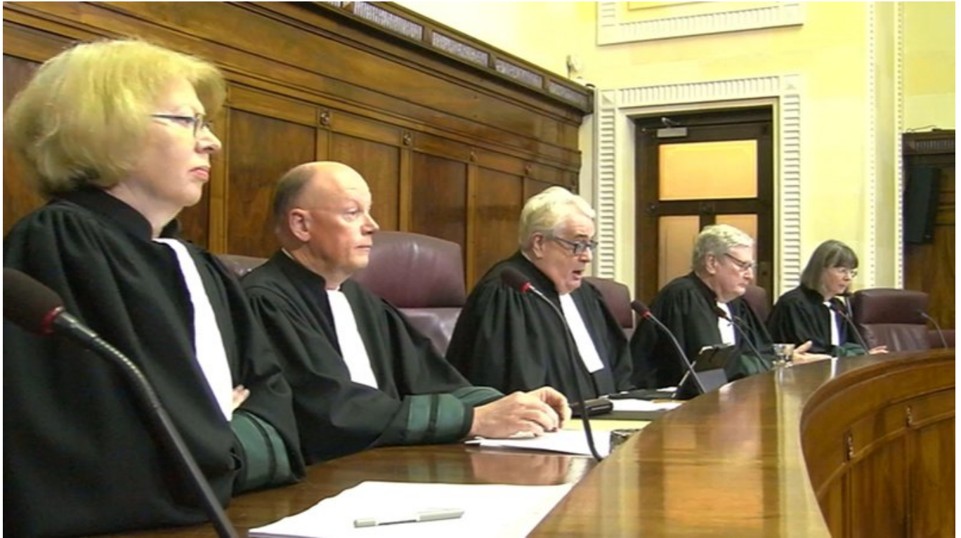
Supreme Court judges photographed at the first ever broadcast of court proceedings in October 2017