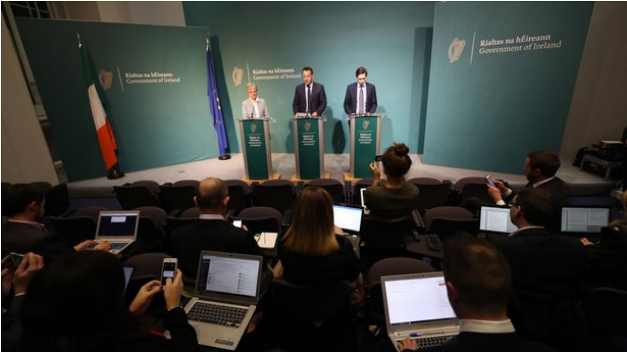
Taoiseach Leo Varadkar, Minister for Health Simon Harris and Children's Minister Katherine Zappone speaking at a press conference last night after the Cabinet approved plans for a referendum on the Eighth Amendment

rights under Article 42A begin at a set point during pregnancy. However, this would appear unnecessary to resolve this particular case.