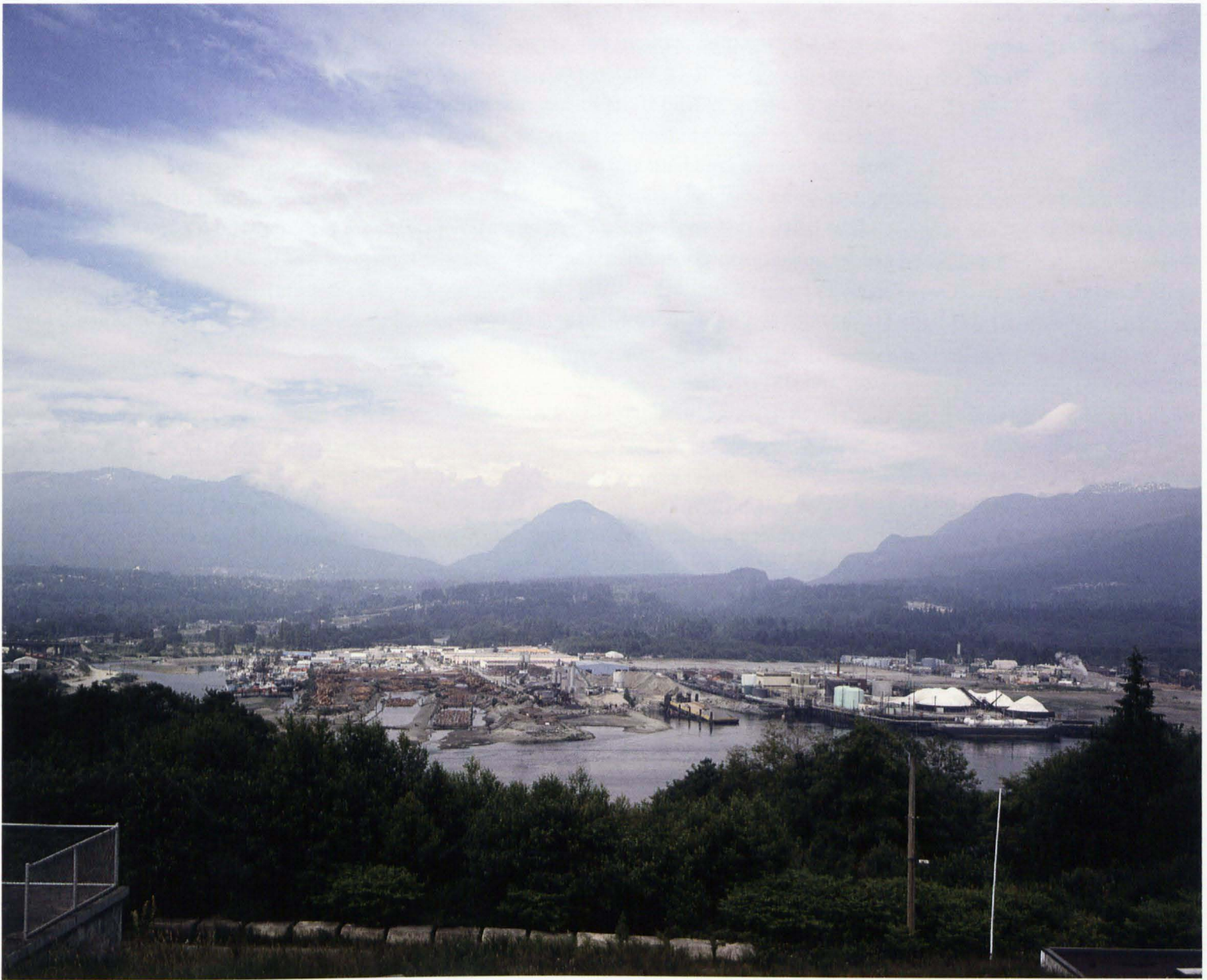
Fig. 3 Jeff Wall Coastal Motifs , 1989 Transparency in light-box, 119 x 147 cm

pictures is, of course, part of an ongoing struggle to differentiate between word and image in a wide-ranging argument that, hopefully, can never be fully resolved. What is written and spoken about art, along with when it is packed in crates and shipped, who promotes it and where, are the means by which art enters into public memory. The gaze of a passing viewer, however, creates another set of links between art works already connected by a shared exhibition space. A viewer's glance addresses a compilation of individual creative views announced at different times and in different places, before these art works are viewed today in this gallery or this book. This moment of looking is the collusion between class, gender and urbanism in practice: the history of art compounded in a tiny gesture of glancing.