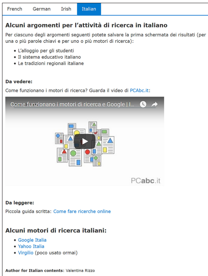
Figure 4. Localisation of Let's search! for Italian