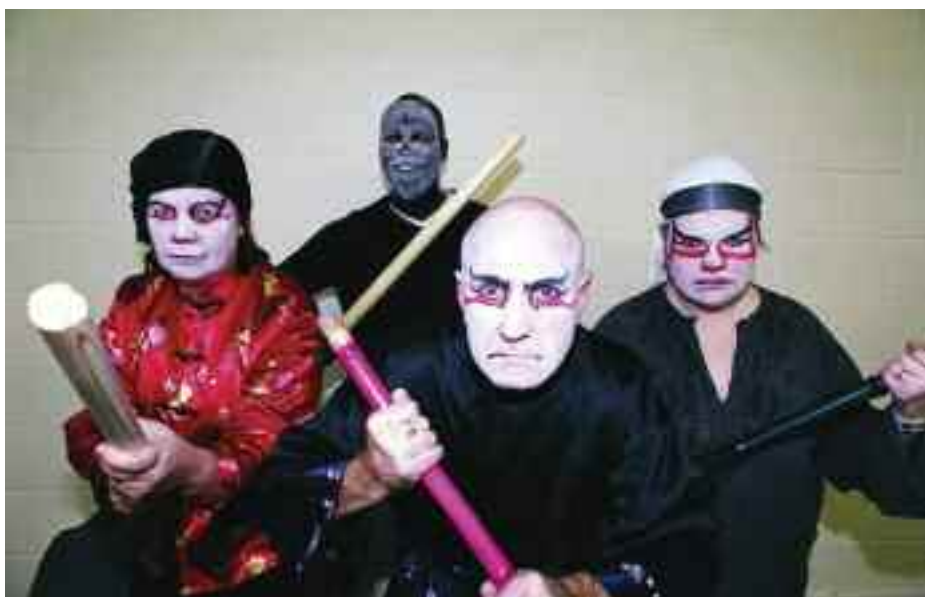
Creative Training performance.

building, conflict and equality in a wider context as well as within the Irish one. Drama and theatre enabled them to explore individual and group stereotypes and perceptions, and themes of conflict ran throughout the course, for example violence, sectarianism, paramilitary activity and racism.