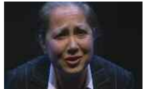
Various images from Smashing Times Theatre Company.