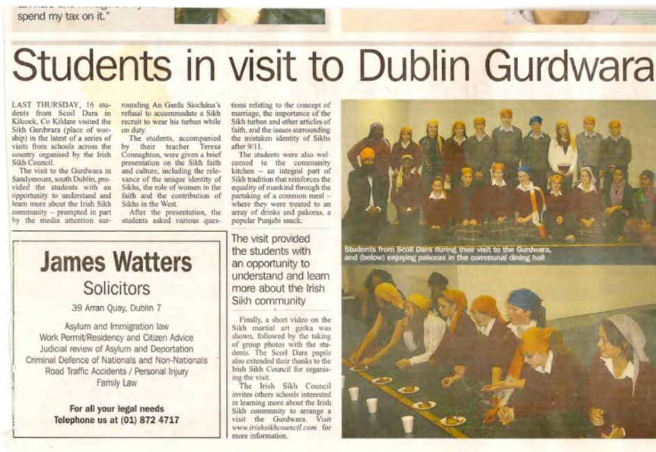
Figure: 38. “Students in Visit to Dublin Gurdwara”, Metro Éireann , 2008.