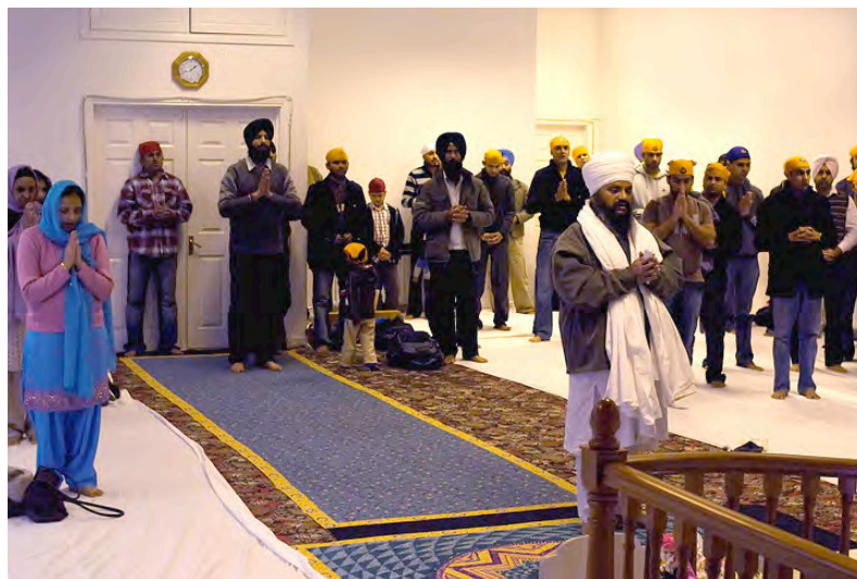
Figure: 32. Standing in prayer, Dublin gurdwara, 2008.