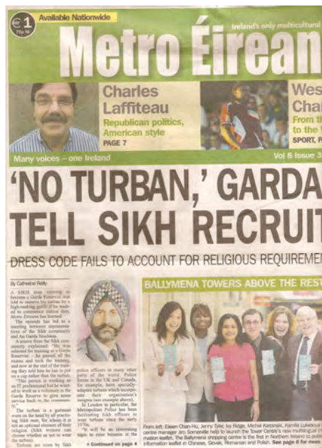
Figure: 24. ‘No Turban’, Gardaí tell Sikh Recruit, Metro Éireann , 7 th June, 2007.

“No Turban, Garda Tell Sikh Recruit”, was the front page headline in Metro Éireann , Ireland’s multicultural weekly, on 7 th June, 2007. Two months later, on 13 th August, the story was covered by the Irish Independent and it became a hot topic for media coverage and hence for public debate. Sikhs were thus catapulted to the centre of the debate on integration and diversity in Ireland by virtue of the public debate about secularisation of public offices in relation to the controversy caused by the Gardaí’s refusal to allow Sikh recruits to wear the turban. Apart from drawing attention to the Sikh community, the debate also unearthed broader and deeper issues of cultural and religious diversity and integration in Ireland as a result of inward migration. The resultant debate started around the importance of the turban to Sikh men and zeroed in on allowing for the diversity of different faiths by highlighting the disparity between policy and practice. Even though government policy documents stressed that ‘integration is a two-way process,’ in practice, state bodies choose to singularly place