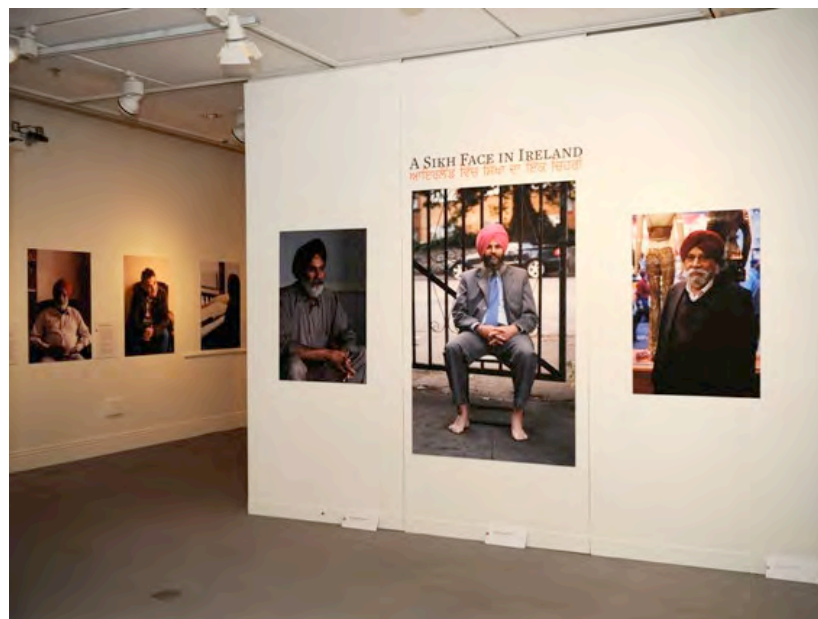
Figure: 8 Entrance view of A Sikh Face in Ireland exhibit in Chester Beatty Library, Dublin Castle, May 2010.

1.10.1 Exhibition: For the exhibition, 50 large portraits of Sikhs in Ireland were originally conceived; however this number increased to 60 life-size portraits and 15 head-shots in order to include Sikhs from the North of Ireland. Launching A Sikh Face in Ireland at the prestigious Chester Beatty Library significantly added to the value of the exhibition. The Chester Beatty, often considered to be one of the best museums in Europe, is one of the most visited tourist attractions in the heart of Dublin. During the exhibition’s five-month run from 7 th May until 26 th September, 2010, some 30, 000 people visited the exhibition, leaving comments in the visitor book that shed retrospective light on what the project had achieved for Ireland and Sikhs in Ireland.