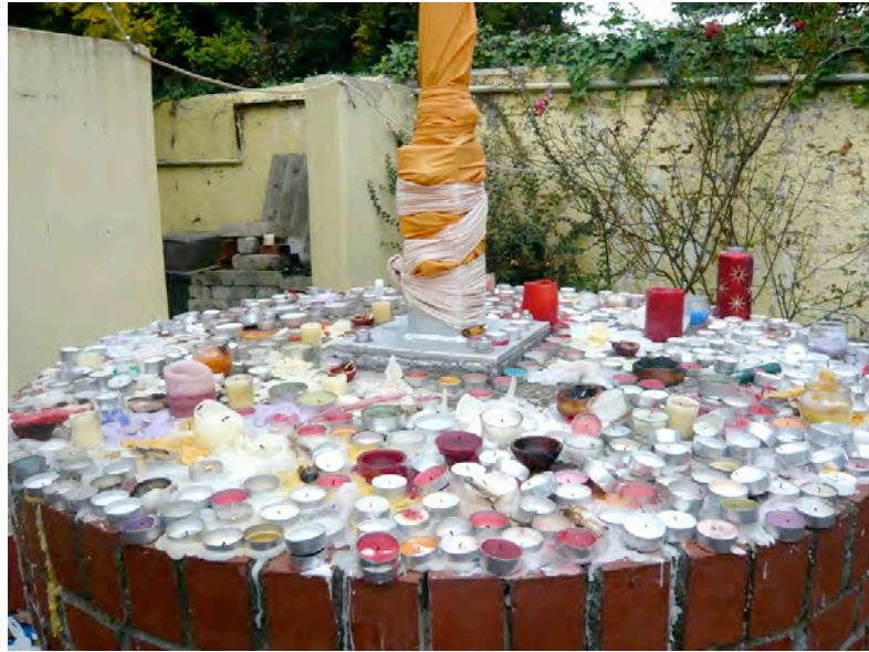
Figure: 3. Base of Nishan Sahib (flagpost) covered with remains of burned out candles on morning after the Diwali (Indian festival of lights), Dublin gurdwara November, 2009.

I regularly observed the proceedings and social interactions in the prayer hall, community dining hall, the kitchen, and at meetings and discussions relating to the gurdwara and the Sikh community. My observations revealed that the gurdwara was being used as a place for celebration for the birth of new babies, and routine accomplishments that made everyday life easier such as the renewal of work permits, the passing of driving tests, or family visits from India. It was also the place where people discussed and circulated information about jobs, houses, insurance, cars, fashion, etc., and developed their skills in cooking traditional food in the gurdwara kitchen. As a result, I began to develop a better understanding of its multi-dimensional role in my life and the life of other Sikh migrants in Ireland. All this assured me of the significance of the gurdwara as an ethnographic research site, helping to understand and delineate its particular role at this point in the migration history of the Irish Sikh community.