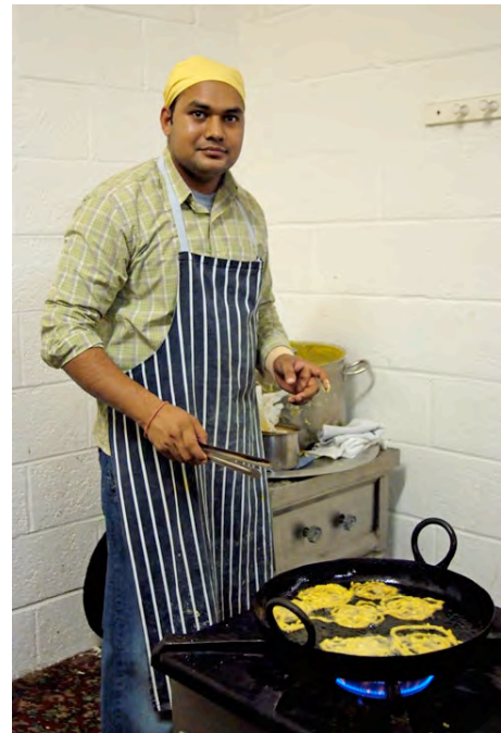
Figure: 41. A non-Sikh Indian Student Making Jalebis (a sugary Indian sweet) in gurdwara kitchen. Photograph: Glenn Jordan, 2009.