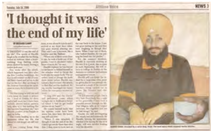
Figure: 23. 'I thought it was the end of my life', Athlone Voice , 26 July, 2005.

This strategy of escaping verbal and physical abuse gained so much popularity that one barber shop in the city centre contacted The Irish Times to report on this, because his business had gone up significantly as Sikh students were going to his shop to cut their hair. Alarmed by this trend, elders of the community held a press conference to inform Irish people about Sikhs. However, the Sikh community was particularly alarmed when a number of Sikhs were physically attacked in Ireland shortly after the terrorist attack in London on 07/07/2005. In one case, a young Sikh student was stabbed in Athlone. In other instances, four young Sikhs were physically beaten by local people who considered them responsible for terrorist attacks.