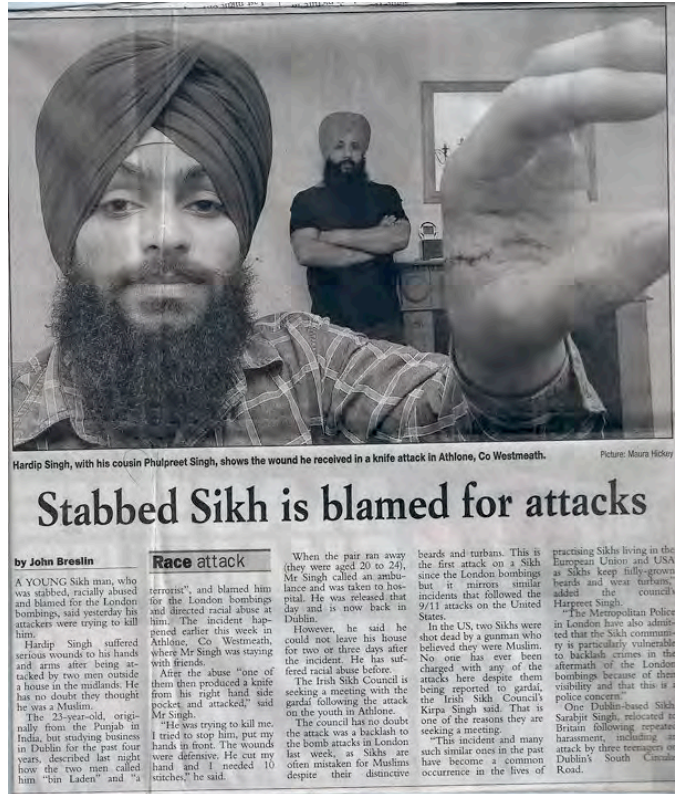
Figure: 21. “Stabbed Sikh Blamed for Attacks,” Irish Examiner , 15 th July 2005.

Ireland, housing and food became the most serious problem. Students shared accommodation in order to survive.