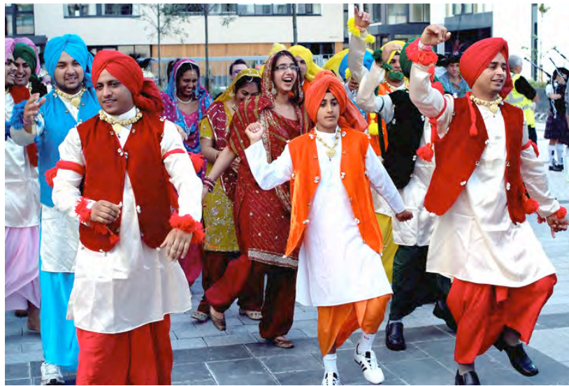
Figure: 36. Bhangra Dancers, Festival of World Cultures, Dún Laoghaire, County Dublin, July 2009.