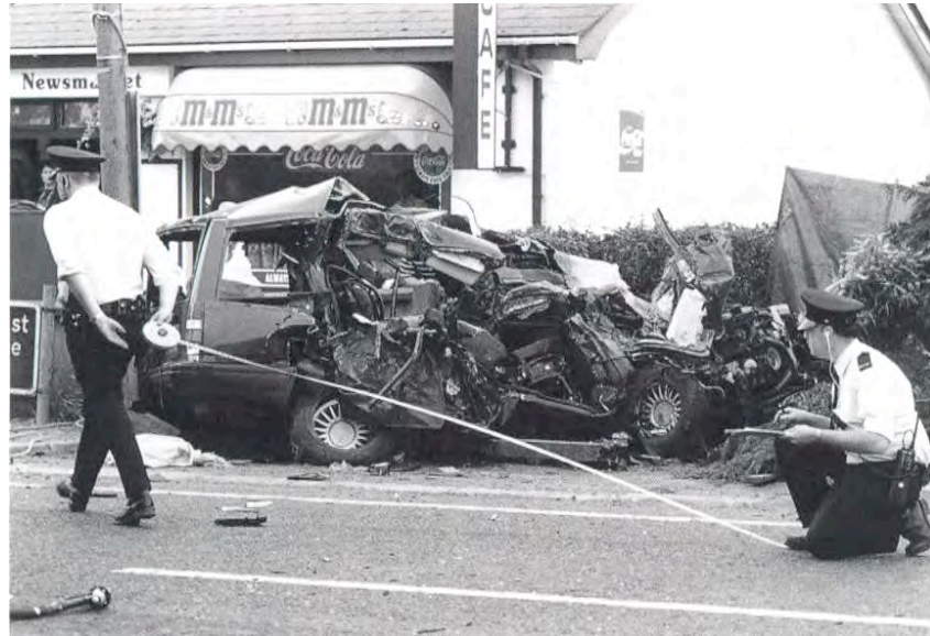
Figure: 27. Wreckage of Car accident in NI that killed four members of a Sikh family in 1995, including three girls aged between five and two. Photograph – Courtesy of Narinder Kapur, 1997.

big lorry coming in the opposite direction overturned on the Volvo car, which Harminder was driving. The accident killed Harminder, his two daughters and a niece on the spot.