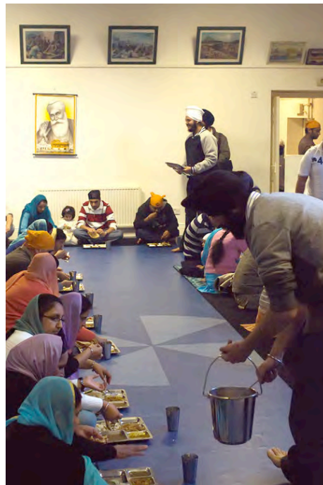
Figure: 33. ‘Langar’ (Communal Meal) being served in the gurdwara .