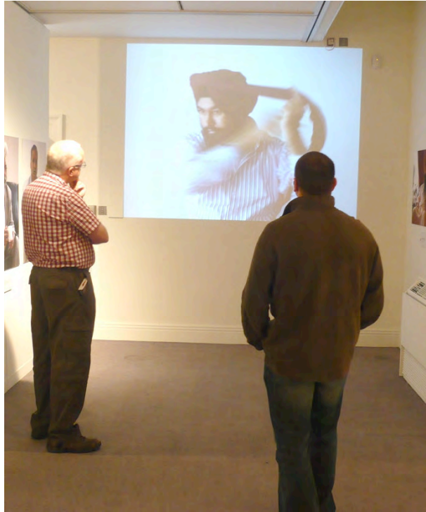
Figure: 9. Visitors watching the How to tie a Turban? Video in the Chester Beatty Library, Dublin.