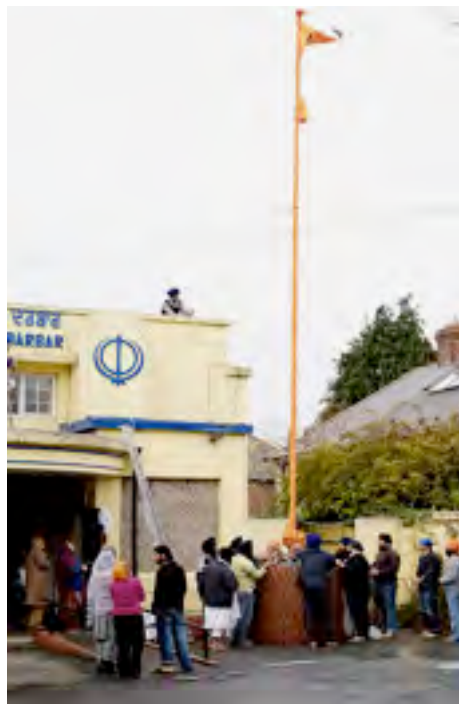
Figure: 2. Flag Changing Ceremony, Dublin gurdwara , 2008.

Located on Serpentine Avenue in Ballsbridge, a prosperous area near Dublin city centre and the sea, the Dublin gurdwara is the central religious and cultural institution for the people of Sikh heritage living in Ireland. Every Sunday afternoon, a congregation consisting of up to 300 people comes to participate in the religious service and