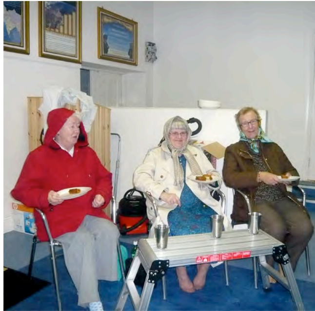
Figure: 34. Three members of Longford Women’s Link, guests of Irish Sikh Council, at Dublin gurdwara, 2009.