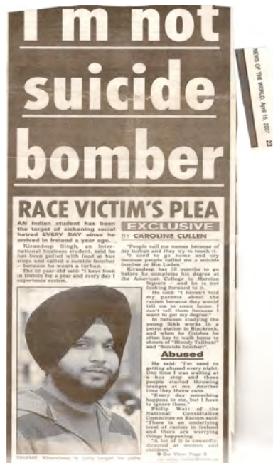
Figure: 22. News item highlighting the case of racial abuse due to ignorance about Sikhs and prejudice toward Muslims as a perceived threat. Cullen, C (2007) “I’m not a Suicide Bomber”, The News of the World , 15 April.

bin laden 63 . In particular, Sikhs with turbans in the United States have been murdered 64 , stabbed, assaulted, verbally harassed, discriminated against in the workplace, and refused service in places of public accommodation, among other things (Gohil and Sidhu, 2008). Sikhs in the United States were the worst affected, but the situation in other western countries was also very serious, where Sikhs faced similar problems following the 9/11 and 7/7 bombings. In Ireland, many Sikh students and professionals came in 2001, shortly before or after September 11.