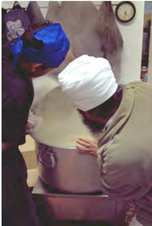
Figure: 30. Cooking Rice, Dublin gurdwara .