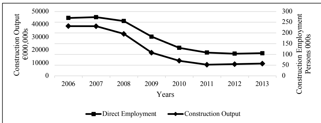
Figure 1: Correlation between changes in construction employment and construction output (SCSI, 2014) (DKM, 2016)

In 2008, following a decade of unprecedented growth, Ireland suffered its most devastating economic downturn in living memory. Much of this economic collapse was due to an over-reliance upon construction by the Irish economy. At its peak, in 2007, construction industry output in Ireland accounted for almost one-quarter of the country’s GNP while construction employment accounted for approximately 18 percent of total national employment (DKM, 2016). Construction output had overshot sustainable levels for an economy the size of Ireland’s and was twice that of the accepted norm of 10-12 percent of GNP (Forfás, 2013).