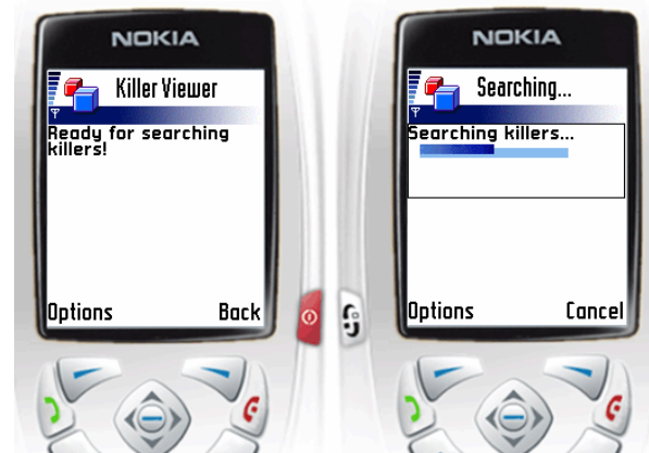
Figure 2: Screenshots of Bluetooth Assassin running on the Nokia emulator

The game was developed using Java, Bluetooth and MYSQL. Although development was predominantly carried out using mobile phone simulators, the final game runs smoothly on a range of real devices and games have been played successfully. Figure 2 shows screenshots of the game running in the Nokia mobile phone simulator.