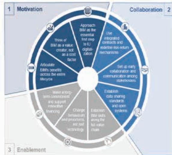
Figure 2 – WEF BIM Adoption Circle [1]

accelerate BIM adoption and better capitalise on delivering better project outcomes. The output of a consultation roundtable discussion with over 35 globally respected stakeholders in construction is illustrated in Figure 2.