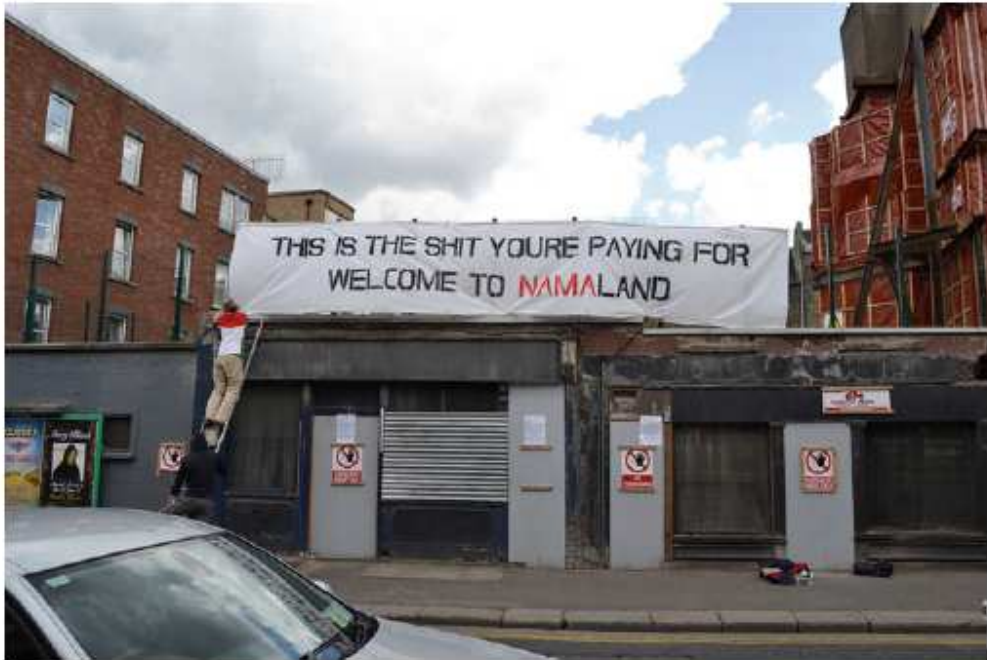
Fig. 5.5 Welcome to NAMALand banner in Dublin

NAMALand through its activation of these sites has informed and influenced groups and through a focus on locational specificity supported by data has introduced new approaches to the urban intervention as artistic and activist tactic. The project has acted as a resource on which further actions can be built and the cumulative effect of these interventions and their surrounding debate has achieved some concrete results. Dublin City opened direct negotiations with NAMA to access vacant properties under their control for social and cultural use. This has resulted in a city program which allocates vacant buildings for cultural uses with substantial premises being made available. This has been accompanied by the release of more information on NAMA property which, while not nearly complete, has fed the growing demand that vacant properties be opened for community use.