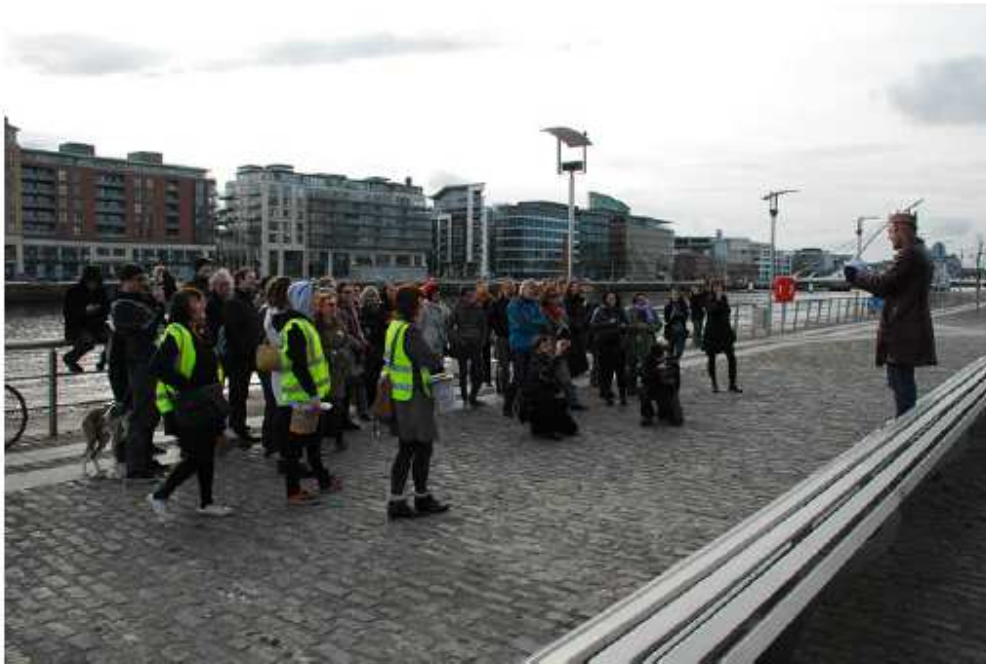
Fig. 5.4 NAMA-Rama walk in Dublin's docklands

NAMAland on one level exists as a mobile app which over-layered the city with a contextual data layer re-presenting the city as a network of property and interconnected