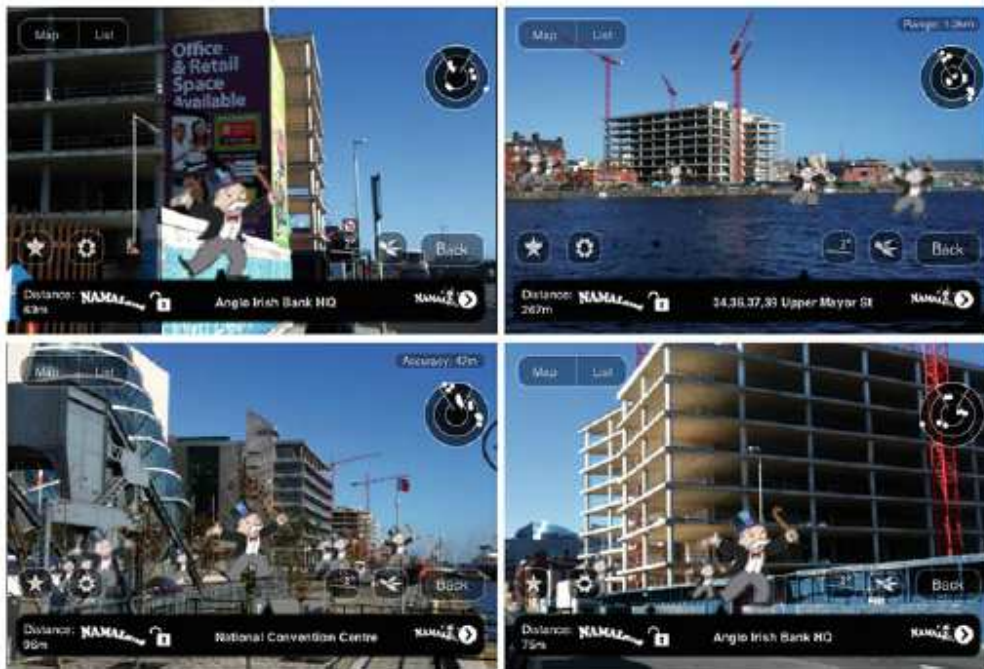
Fig. 5.3 Screenshots showing NAMAland in operation in Dublin city centre