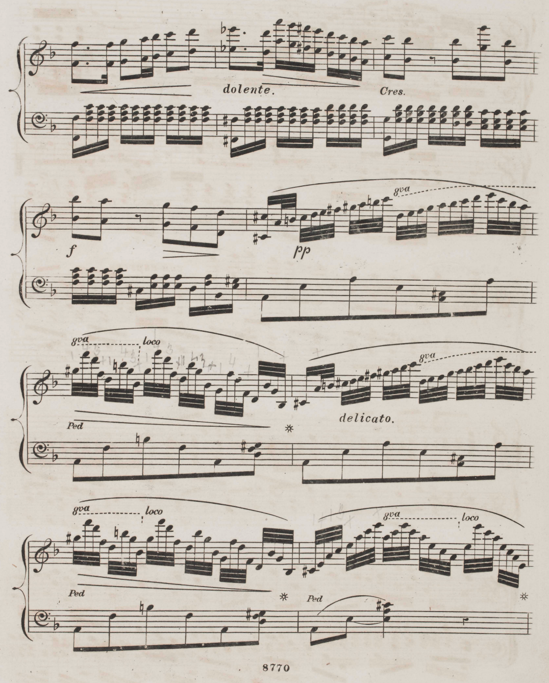
R.COCKS & C? are now Selling the Bell Metronome at 42^8 and without the Bell 26^8 .