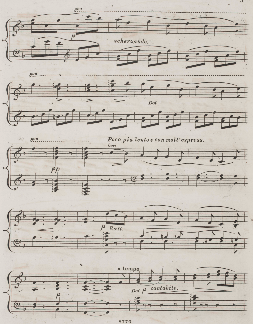
A new Edition of Hamilton's Dictionary of 2500 Musical terms by John Bishop price only 1^{8}/ .