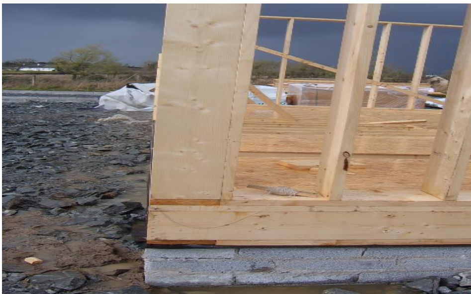
Figure 2: The rising wall, DPC, timber deck and stud wall

The base was a hybrid of standard strip foundation with rising walls built up to DPC level and a suspended timber floor. This is accepted building practice and is covered by regulation. It is just no longer in frequent use. The suspended timber floor was insulated with natural fibre hemp insulation and the subfloor of Irish made 11mm OSB sheathing was made airtight. The use of hard-core, oil-based insulations, membranes and concrete were eliminated.