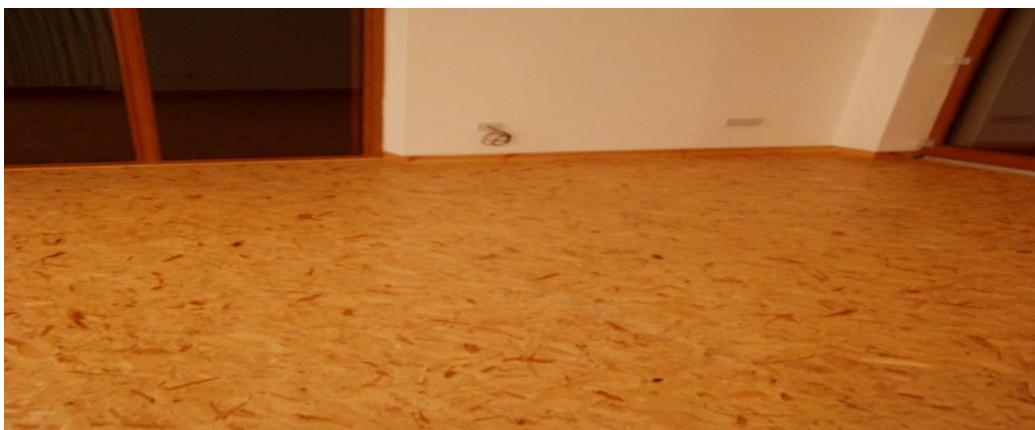
Figure 10: OSB Flooring

Finishes were kept to a minimum. The doors were traditional lath and brace (white deal). Architrave and skirting were reduced to 50mm X 10mm. Standard pine doorstop was used for this. OSB was varnished and left finished for floor covering in main living area.