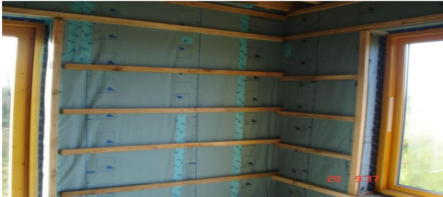
Figure 5: Internal Airtight Membrane and Counter battening

Internally, a paper-based airtight membrane was fitted before counter battening, counter insulating (50mm), plaster boarding, taping and jointing. Large quantities of water were spared by taping and jointing; an Irish manufactured jointing compound was used. Counter-battening allowed for run of services and reduced breaches to the airtight membrane while also allowing for counter insulating which greatly reduced thermal bridging.