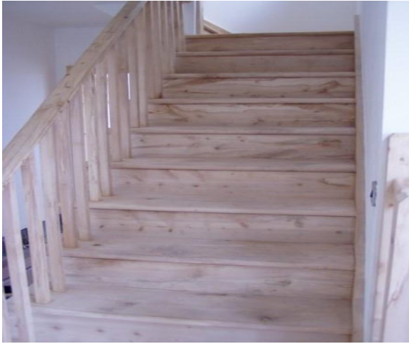
Figure 6: Stairs

The fitted-kitchen was made on site, from material sourced in the local hardware. The stairs was made from a locally grown sycamore, the components being milled before being brought to site and assembled. All components arrived on site as square and planed scantling and dressed as required. Natural paints were used throughout.