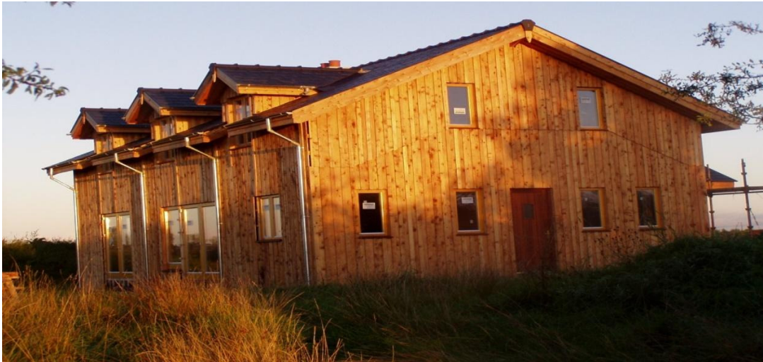
Figure 7: The completed build

The fitted-kitchen was made on site, from material sourced in the local hardware. The stairs was made from a locally grown sycamore, the components being milled before being brought to site and assembled. All components arrived on site as square and planed scantling and dressed as required. Natural paints were used throughout.