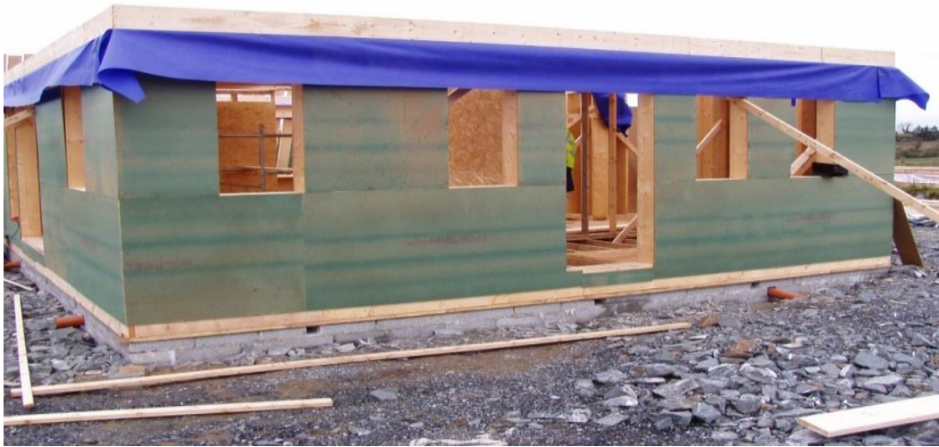
Figure 3: External walls with diffuse open Panelvent

The frame was built on site as opposed to being prefabricated. This method is known as 'stick framing'. A diffuse-open wall was constructed using Panel vent as structural sheathing. The wall was a 275mm stud filled with hemp insulation and made airtight internally. Standard external membranes were used before battening and counter-battening to create a ventilated space and laying on board Irish grown cedar-cladding. Corner details were built to reduce thermal bridging and allow maximum insulation for ease of same.