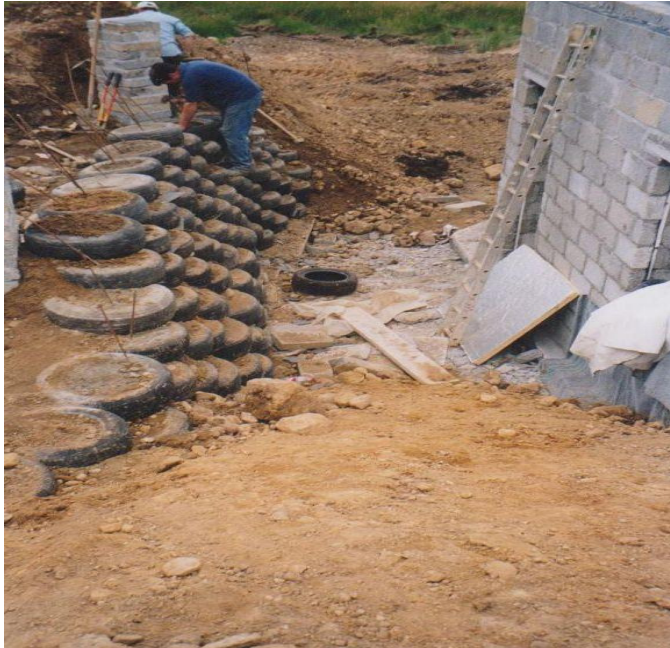
Figure 12: Foundations of the house

Since half of the house is concealed underground, compromises in material had to be made. A concrete-retaining wall and cavity block wall formed the lower section. However, it is only the bottom half that is built with concrete and block. It was decided to use Irish grown timber for the upper portion of the house. This was designed by the architect and the structural engineer to reduce as far as possible, the need for steel. Timber beams and column sections are bolted together to provide the stability.