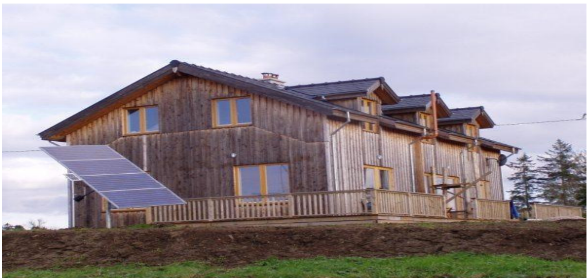
Figure 1: A cedar-clad, timber-frame residence in Carrick-on-Shannon, Co. Leitrim