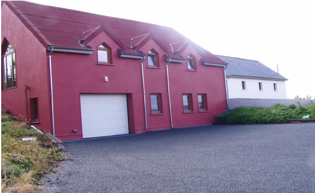
Figure 8: House at Leitrim Village on a one-acre site