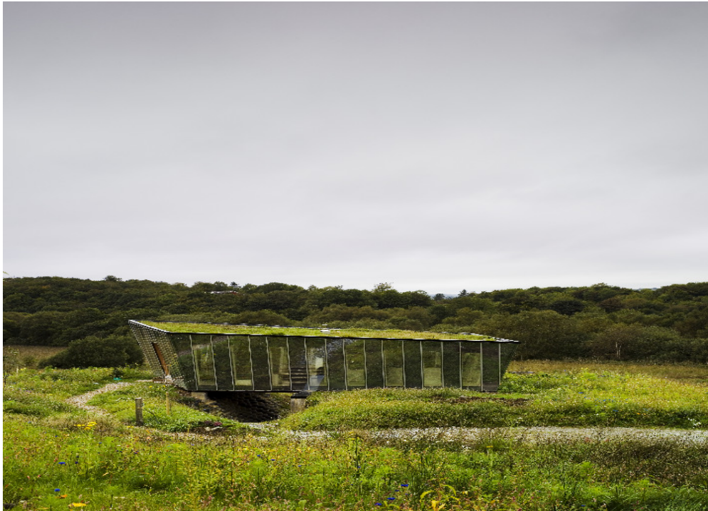
Figure 11: Residence at Dromahair, Co. Leitrim