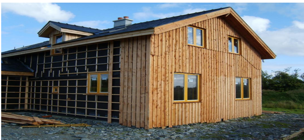
Figure 4: External cladding

The frame was built on site as opposed to being prefabricated. This method is known as 'stick framing'. A diffuse-open wall was constructed using Panel vent as structural sheathing. The wall was a 275mm stud filled with hemp insulation and made airtight internally. Standard external membranes were used before battening and counter-battening to create a ventilated space and laying on board Irish grown cedar-cladding. Corner details were built to reduce thermal bridging and allow maximum insulation for ease of same.