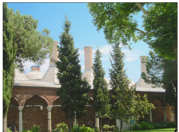
Figure 3. The chimneys of Topkapı Palace kitchens.

Another difference between the ranks was portrayed with drinks. The high ranking officials received sherbet as drinks, which was made from sugar, a very expensive ingredient at the time, and various expensive spices. The lower rank drank only water or sherbets made with honey. Sugar has a symbolic meaning representing the sweet side of life, but at the same time, as an expensive ingredient, it also symbolizes power. In order to show this power, sugar was used plentifully in all the desserts, jams, sherbets as