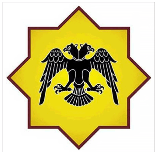
Figure 1 Seljuk Empire's coat of arms.

We rely on another source from this period, and that is the Sufi mystic, scholar, and poet Mevlana Celaleddin Rumi. In his writing, the Seljuk Palace cuisine is shown as very elite, consisting of delicacies and luxurious food served in fine earthenware and gold dishes. Also, we see from Mevlana's writings that certain types of birds (chicken,