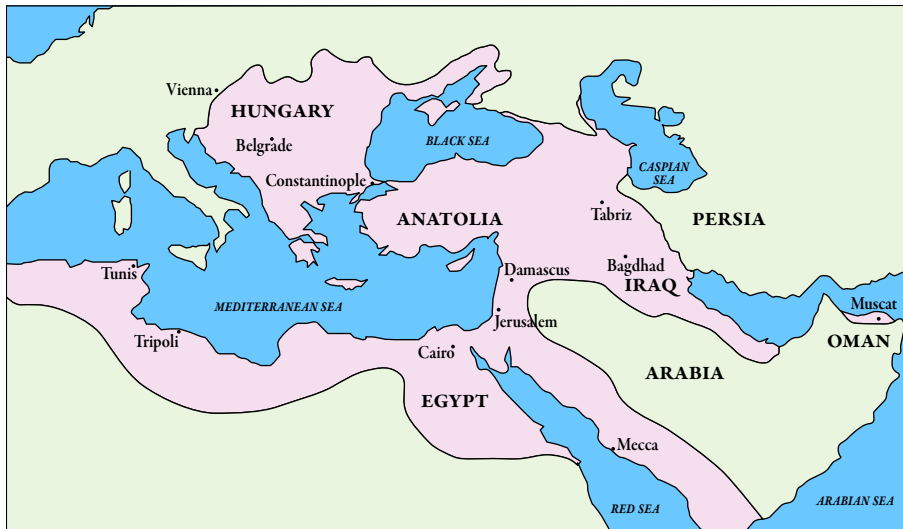
Figure 2. Ottoman Borders in sixteenth century.

words of wisdom played an important role in guiding the sultan to do things that would earn him the respect of his people. Sultans opened imarethane (hospice) to provide for the indigent. Although it may seem that the sultan did this for moral reasons, nurturing his people, in general it was performed to establish his authority as the giver, and gain the loyalty of the receivers, namely his people.