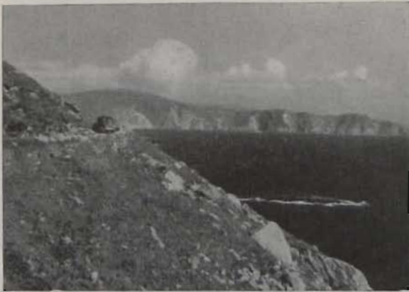
Keem Bay, with Minaun Cliffs on the horizon.