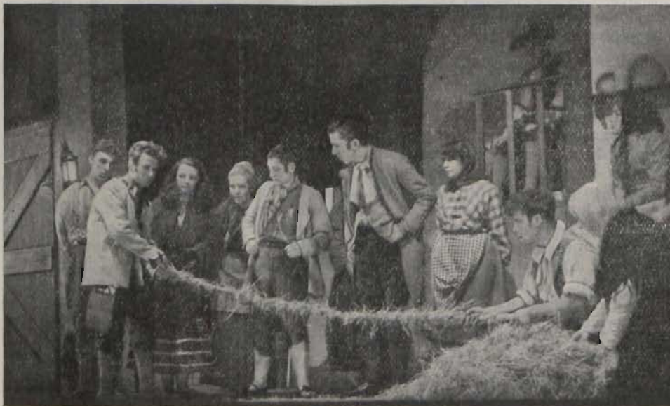
RAÓDAR AS "CASAD AN TSUGÁIN" LEIS AN DOÉTUÍR DUBḡLAS DE HÍDE, (AN CRAOIBHIN DOIBHIN), HAÉTARÁN NA H-ÉIREANN.

Ac píú amáin leis an méid a scriobtar i gCoir an Oireáétais agus taob amuig de sin ní'lo go leor órámaí maíe le pagáil éin na léiriḡeóiri do sásam agus go minic cuirear aisteóilge ar an