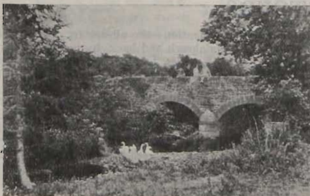
★ Drumully Bridge, in "Sweet Emyvale." ★