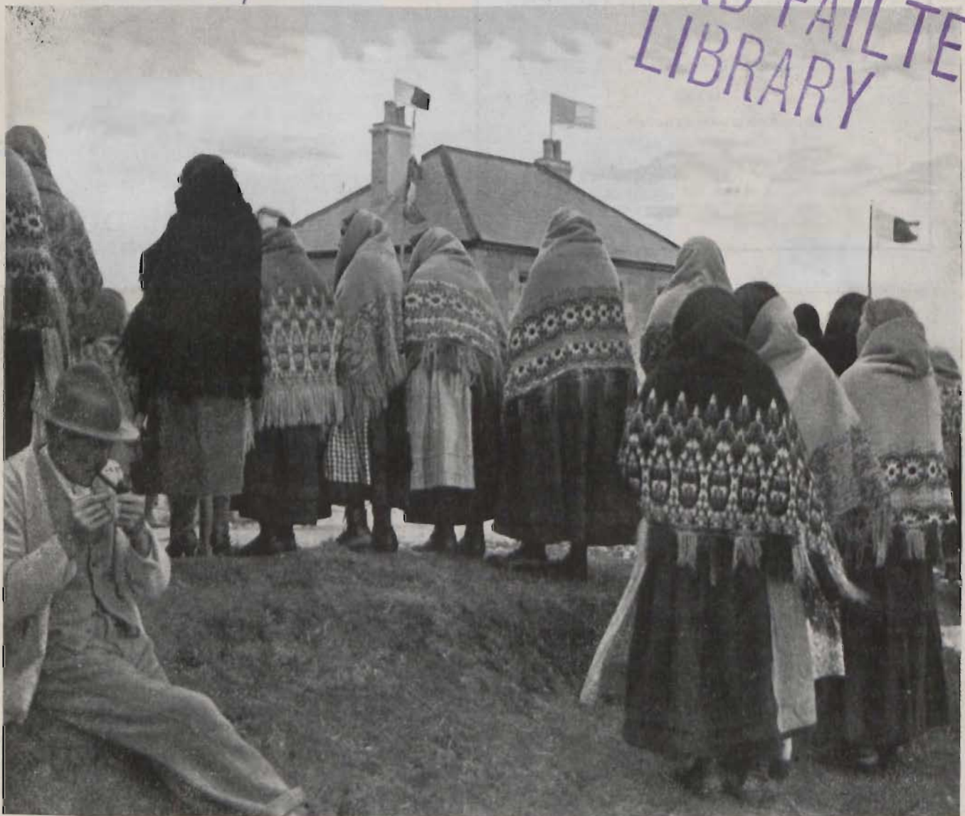
Gorumna Island, Connemara. Waiting to get a glimpse of the Bishop on Confirmation Day.

Impleabap Cumann Luét Cuarda Na h-Éireann Official Organ of the Irish Tourist Association