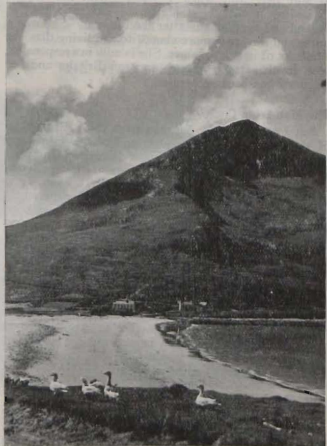
Dugort Strand Beneath Slievemore.