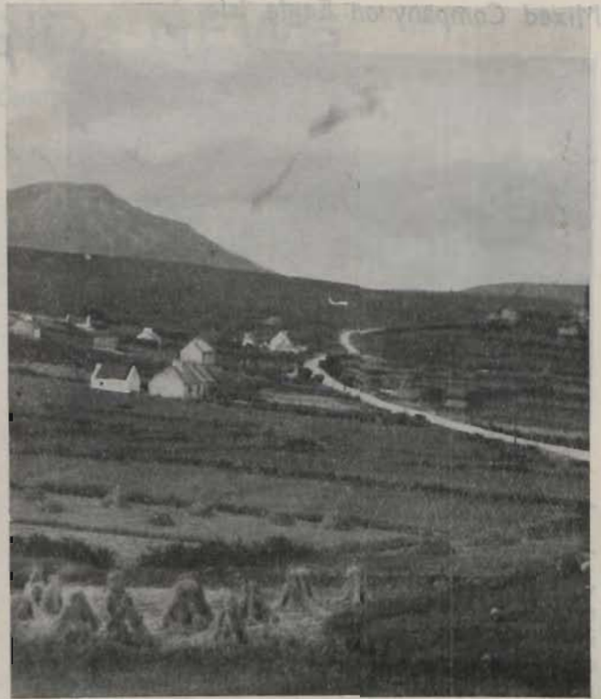
At Cashel Village, in the heart of Achill.

I had intended to stay a bare week. I stayed for three and a bit. We had forgotten the outside world. We were all one family—we knew and laughed at each other's foibles. We got up out of bed to see off those who had to go. It was the custom to go in cars with them to the bridge at Achill Sound, but we wouldn't