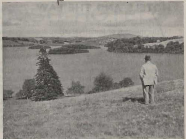
Muckno Lake with far-famed Slieve Gullion in the background.

I HAVE listened with interest to many wireless talks, describing the grandeur of cliffs washed by the Atlantic and of awe-inspiring mountain ranges in the South, but there is a quiet little County, in Southern Ulster, which I feel should be better known to holiday-makers. I refer to Monaghan—"the County of little hills."