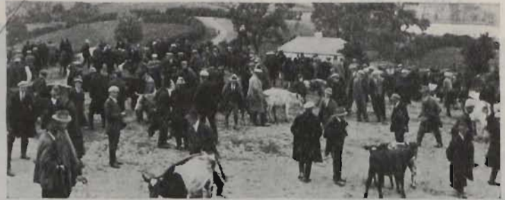
Buying and Selling Cattle.