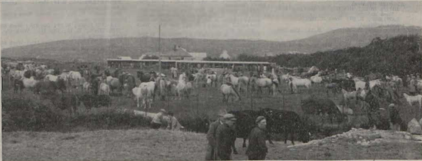
Scene at the famous Connemara Pony Show held at Carna, on August 28th. Entries showed an increase on last year.

3 p.m. IRISH HOTELS' FEDERATION ANNUAL GENERAL MEETING in Jury's Hotel, Dublin.