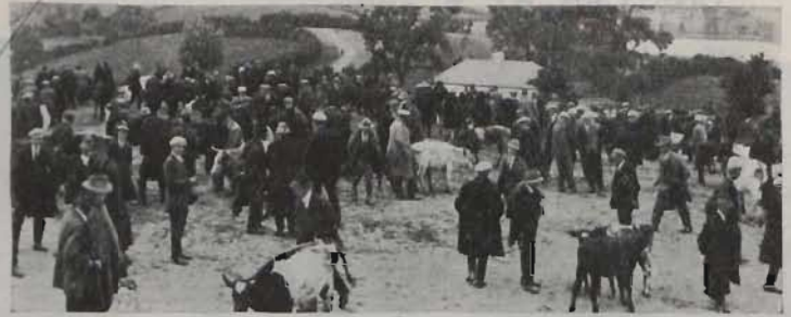
Buying and Selling Cattle.