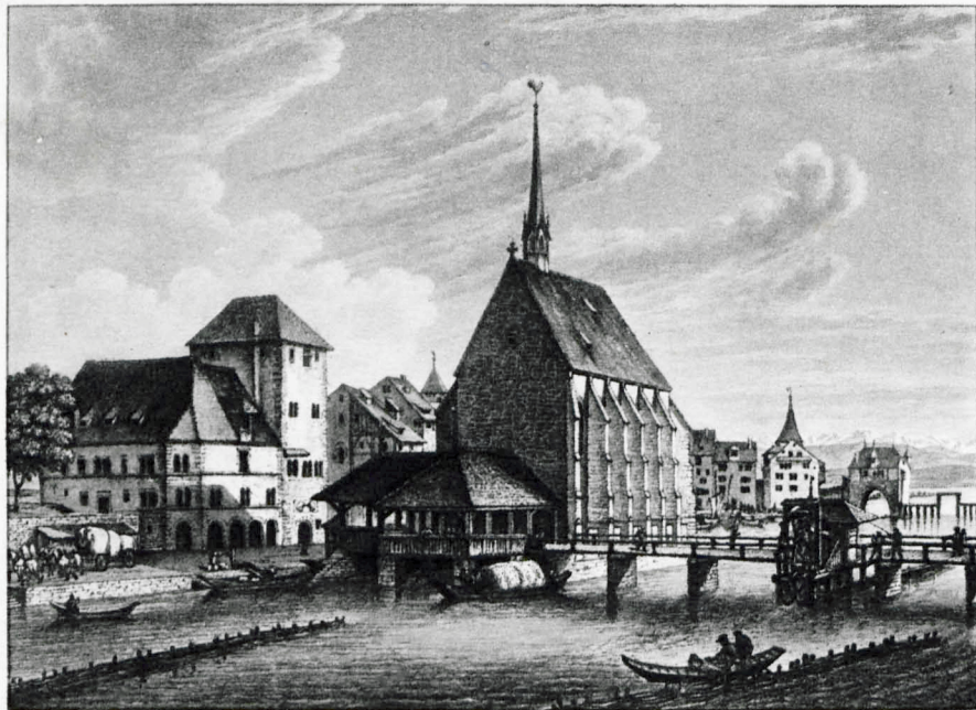
ZÜRICH Wasserkirche mit Helmbaus und Hottingerturm