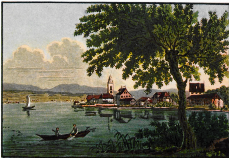
Meilen, village au lac de Lucerne.