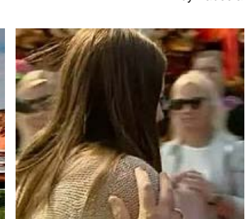
VIDEO: 8-year-old girl dies after being thrown from theme park ride