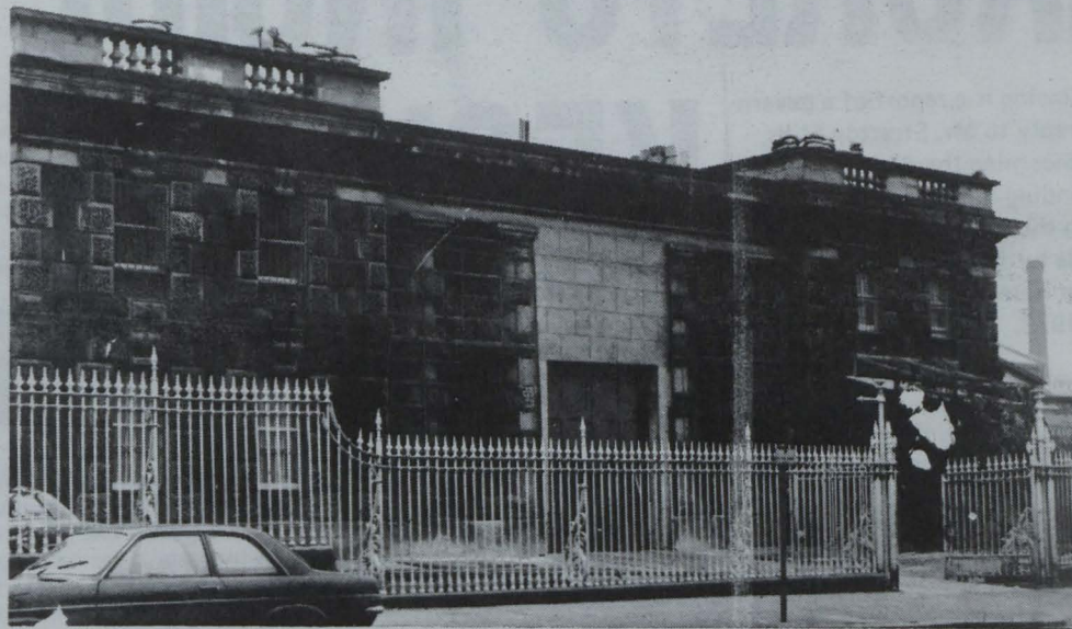
CRUMLIN ROAD PRISON, BELFAST