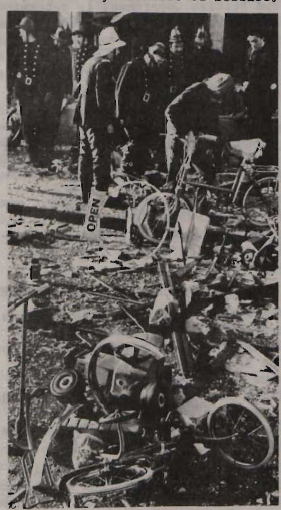
The I.R.S.P. want a return to this

Classified in the news media as some unexplainable petty feud, the violence of recent weeks has been rarely understood by the war-weary citizens of Belfast.