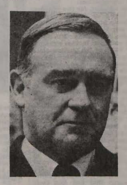
WHAT'S MINED IS OUR'S ...

Such firms as AMAX EXPLORATION, RIO TINTO and TARA EXPLORATION have been granted nearly 50 licences in the 6 counties.