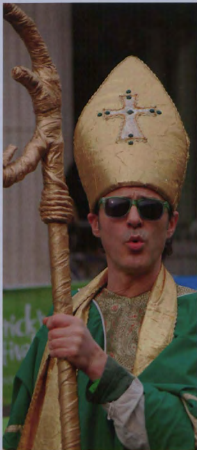
St. Patrick's outfits, for Hallow'en fancy dress or St. Patrick's celebrations, are always useful for social outings in term time

F our things are certain in the life of a DIT student- you'll eat, drink, breathe and hear the 'City is your Campus' sound bite again, and again, and a few more times after that.