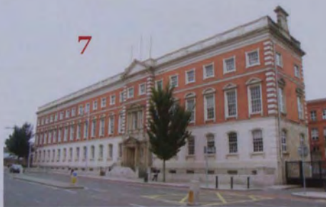
DIT Bolton St