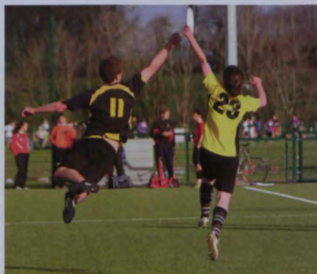
Ultimate Frisbee Soc in action

Pool & Snooker Club doesn't receive a lot of recognition, but its members love it and are keen to encourage new people to get involved.