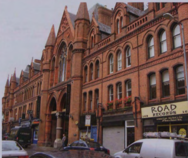
George's Arcade is a favourite for boutique shoppers