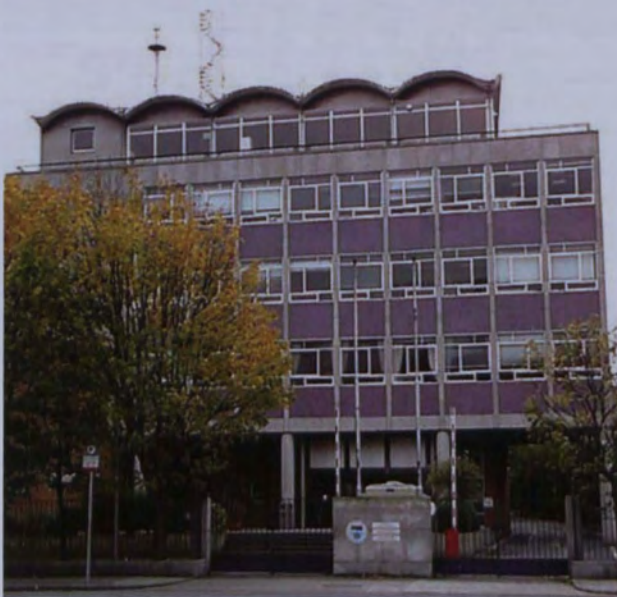
DIT Kevin St was voted dirtiest college campus in Ireland last year

Kevin Street is just across from the Aungier Street campus. Inside you'll find Gleeson Hall, where the DIT Rathmines students perform their musicals each