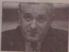
Bertie Ahern has pulled another political masterstroke