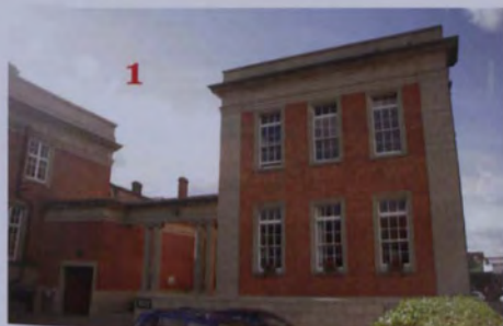
DIT Rathmines conservatory of music