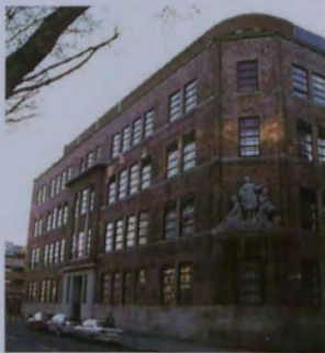
Cathal Brugha Street

Take a trip to Cathal Brugha Street and gorge yourself on their fine lunches. It even has its own fancy restaurant where you can be wined and dined by culinary students all for a budget price of €10. Another big plus for Cathal Brugha is that it houses the cosiest SU area in DIT. For pints after college, hit The Living Room across the street.