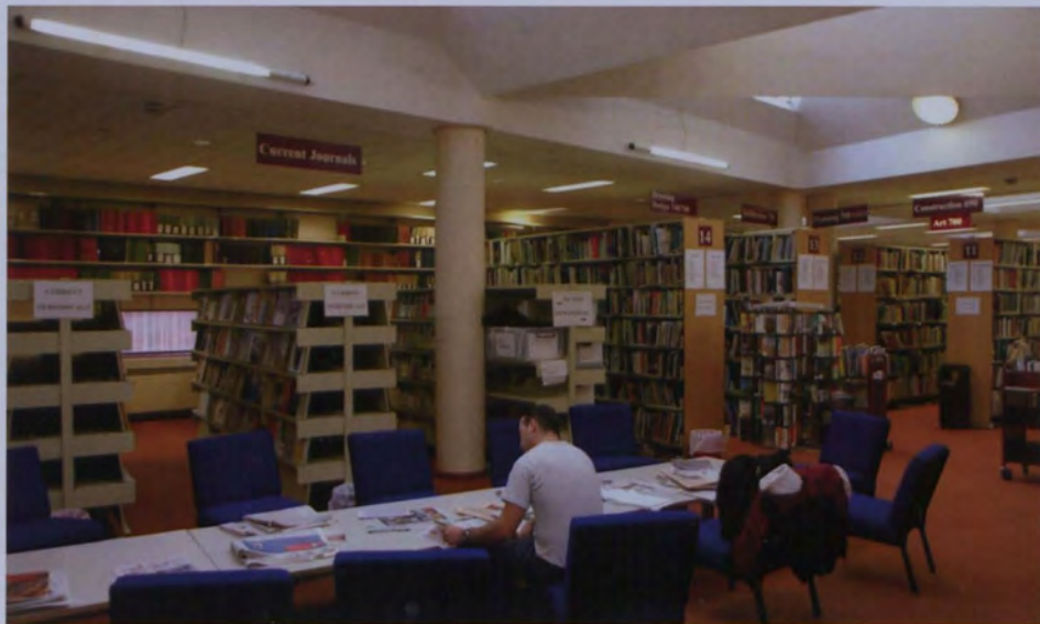
The DIT Bolton Street library is a great place to for peace and quite, whether to study or just relax and read

lynch@dit.ie. The counselling service is open Monday to Friday 9am-6pm both during term time and during the holidays. It provides a place to talk about personal concerns or academic problems.