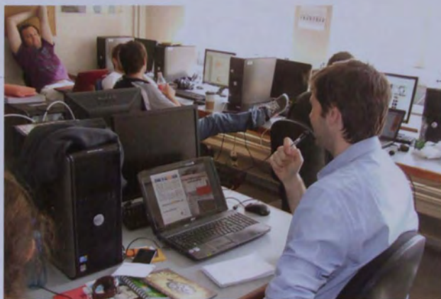
The Edition news team "hard at work" on the Freshers' Guide

But this paper isn't just about sexy and exciting breaking news or a vibrant newsroom; we are all about the social. Along with regular socials and editorial