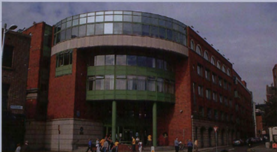
DIT Aungier St is the colleges biggest campus, close to Grafton St and the amenities of Camden St