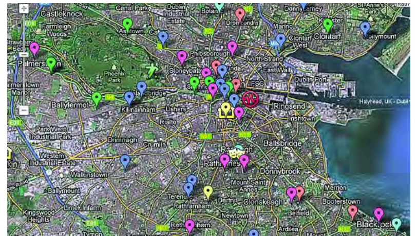
Chruth Gaelscéal ímlíne den Phobail na Gaeilge i mBaile Átha Cliath