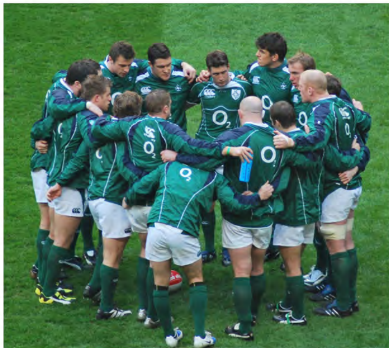
Ireland's rugby team in a pre-match huddle last autumn.

This is highlighted by the fact that in a period where Irish sides have taken home five of the last seven Heineken Cups, the International side has only managed to