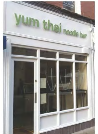
Yum Thai on Duke St

Much better than other comparable quick service eateries but take it easy with the rice/noodles no msg, artificial colourings