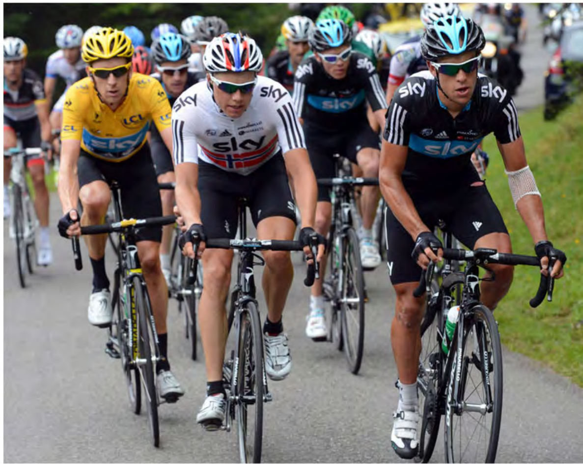
Bradley Wiggins and Team Sky in the Tour de France - the sport might struggle to recover its reputation after the latest scandal and its aftermath.

Armstrong's former Astana teammate Alberto Contador recently returned from a