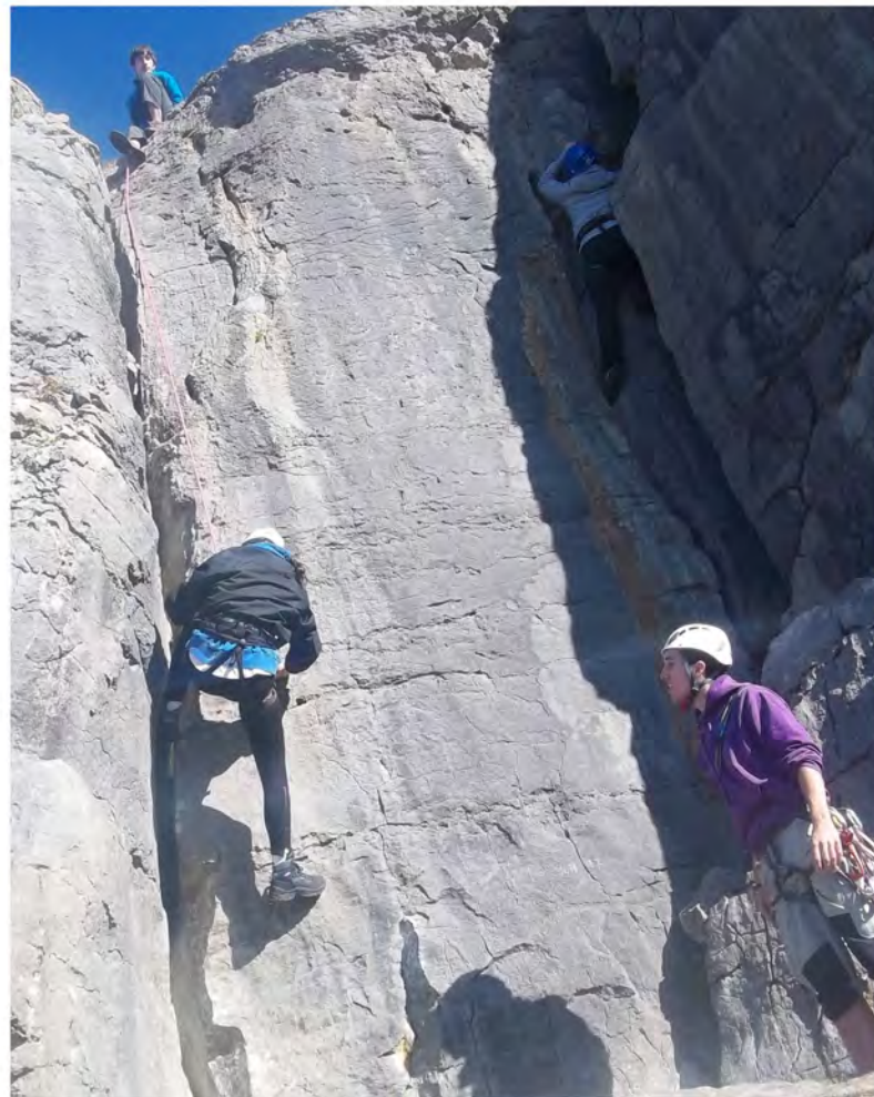
Onwards and upwards - DIT mountaineers climb a limescale rock face in Ailladie.