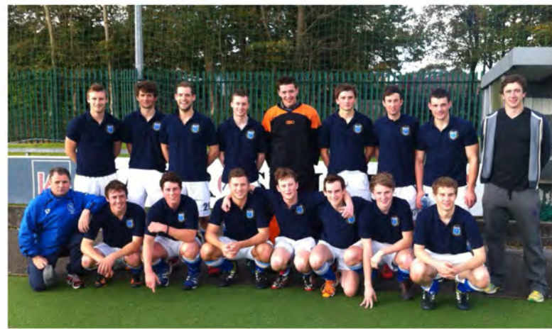
DIT's hockey team got off to a great start in their first year of Intervarsities competition.

After the climb we all went back to the hostel and packed out bags and went back to Dublin. On the way back some people fell asleep as some of us stayed awake late into the nights and then had to get up and go climbing/walking. Overall everyone that went on the trip enjoyed it and has brought back some great memories.