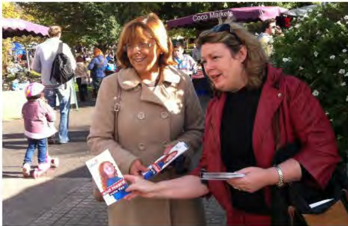
Labour Party campaigners hand out leaflets on the Children's Referendum, which will be held on Saturday, November 10th

students finally have their wish for a vote on Saturday. This is your chance – over 160,000 of you – to show that it makes a difference, by coming out to cast your vote.