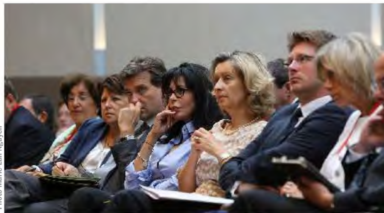
Hélène Conway-Mouret, pictured third from the right, at the twentieth conference of French ambassadors in the summer.

A recent and dramatic gesture for gender equality within politics came in May 2012 from minister Conway-Mourets very own French government. Newly elected President Francois Hollande promised an