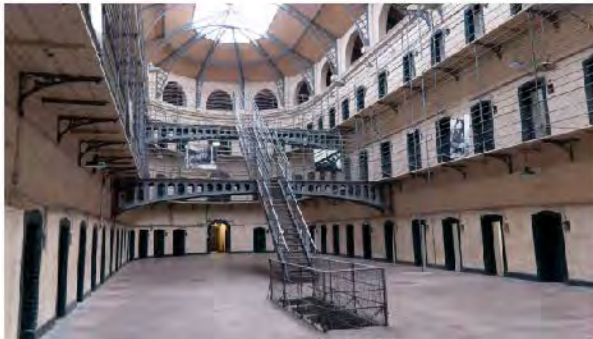
Kilmainham Jail, former prison and now a museum, has been run since the mid-1980s by the Office of Public Works.

The survey will be overseen by the New Schools Establishment Group. The independent group will publish a detailed report following the surveys conclusion.