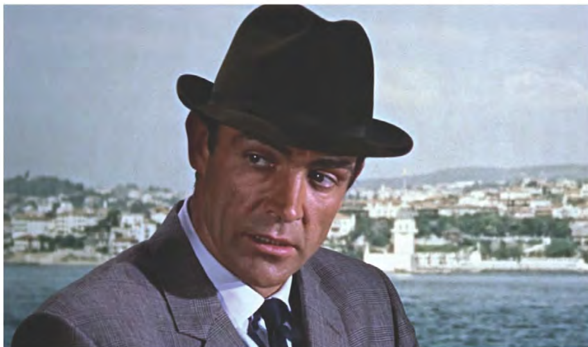
Sean Connery appearing as Bond in Doctor No

However Bond, an eternal enemy of the Iron Curtain seemed to have beaten