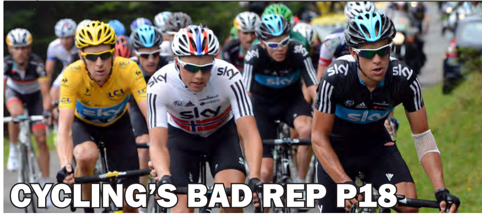
CYCLING'S BAD REP P18