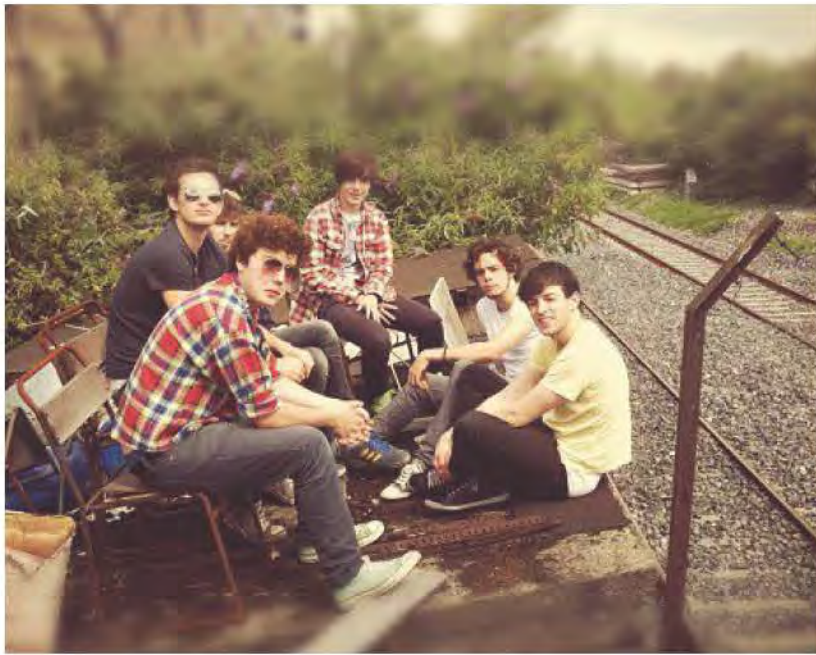
Clockwise from left: We Are Alive, White Collar Boy, Eaten By Bears

Since the release of their latest EP, My Friend The Bombmaker , in July of this year, the band have been busy racking up