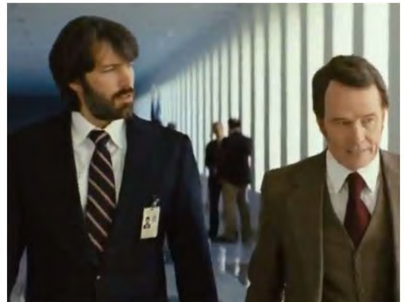
Ben Affleck wasn't happy with Brian Cranston's comments on his beard