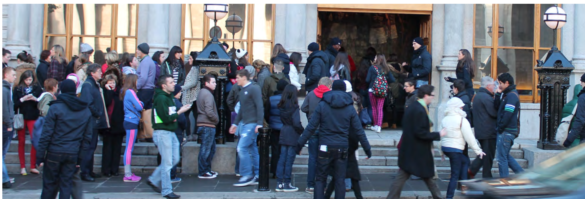
Crowds poured in Abercrombie and Fitch on the opening day, Thursday 1 November. A&F were unable to comment on why the store opened a week later than the proposed 26 October date.