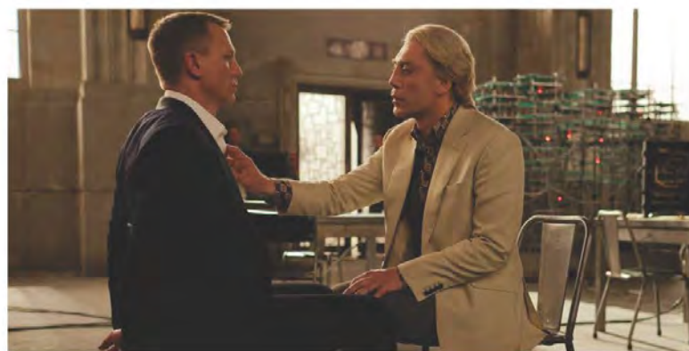
Daniel Craig in Skyfall

Oscar winner Javier Bardem plays the obligatory nasty/camp villain with revenge in mind, while fellow Oscar winner Judi Dench sets the ball rolling on his capture before two-time Oscar nominee Ralph Fiennes’s bureaucratic meddling moves the goal posts on this