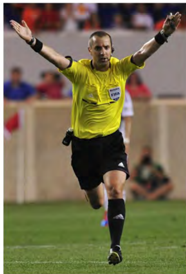
Referee Mark Geiger

To get back to the football, I'm a United fan and I watched in a general state of confusion as Torres was sent off. He went down to easily but that was never a sending off. The old adage of two wrongs don't make a right reared its ugly clichéd head because Torres shouldn't have even been on the pitch at that point. Taking his inspiration from Nigel de Jong he tried to