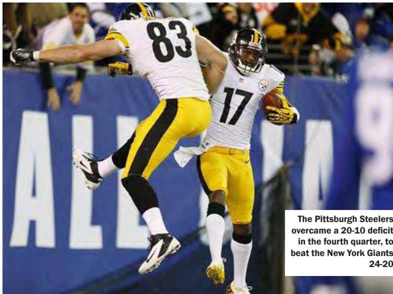
The Pittsburgh Steelers overcame a 20-10 deficit in the fourth quarter, to beat the New York Giants 24-20

However, a long drive from Atlanta, helped by Dallas indiscipline, ran down the clock and ended with a field goal. This