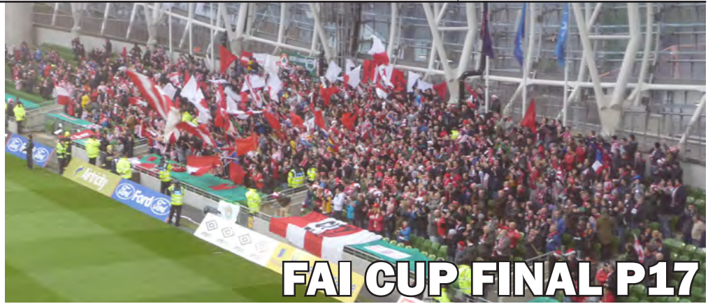
FAI CUP FINAL P17