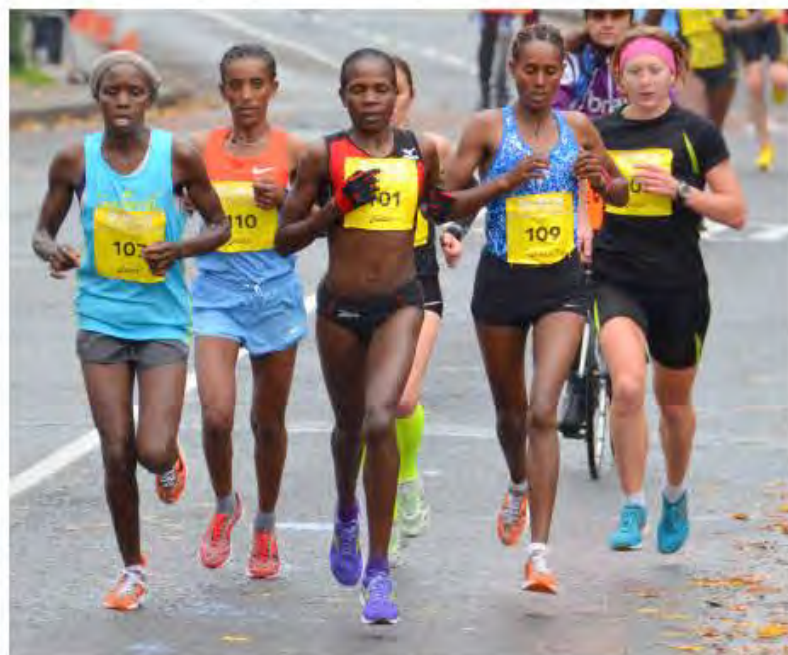
Dublin Marathon female leaders at the race which took place on 29 October

his first ever marathon came to fruition at the halfway point when the Belfast