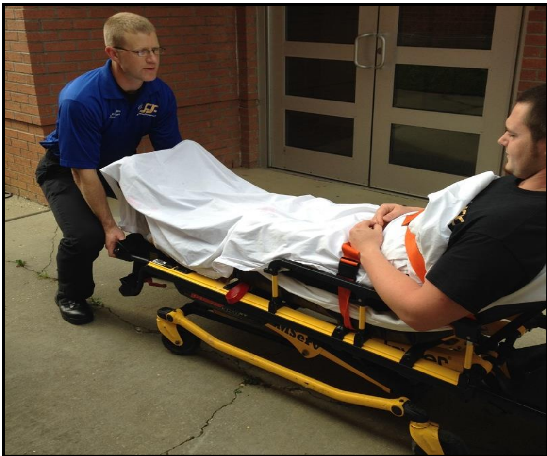
Figure 4. One medic raising a hydraulic stretcher (2016).

Ergonomic interventions, such as a hydraulic stretcher, reduce workforce and financial losses associated with OAIs (Brice et al., 2012; Fredericks et al., 2009; Studnek et al., 2011). Studnek et al. (2011) and Fredericks et al. (2009) demonstrate that hydraulic stretchers decrease the number of OAIs and associated expenses. Hydraulic stretchers modify the lifting technique and lessen the workload for medics during stretcher operations (Brice et al., 2012; Erich, 2005, 2013a, 2013b; Studnek et al., 2011). The hydraulic stretcher can be raised into position by one medic as shown in Figures 4 and 5, by activating the hydraulic lift mechanism (Brice et al., 2012; Studnek et al., 2011).