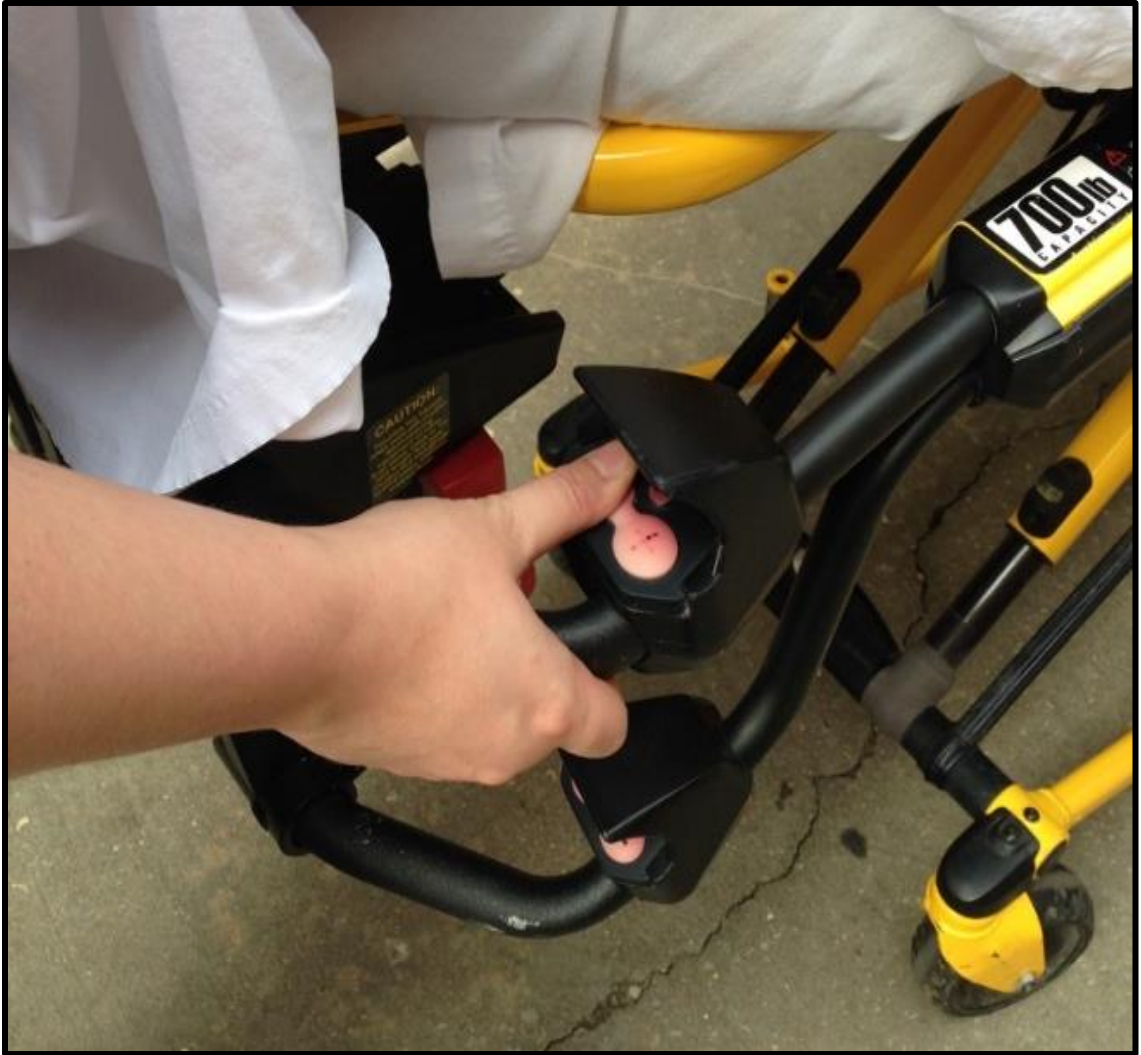
Figure 5. Battery powered hydraulic lift mechanisms are activated by pushing a button (2016).