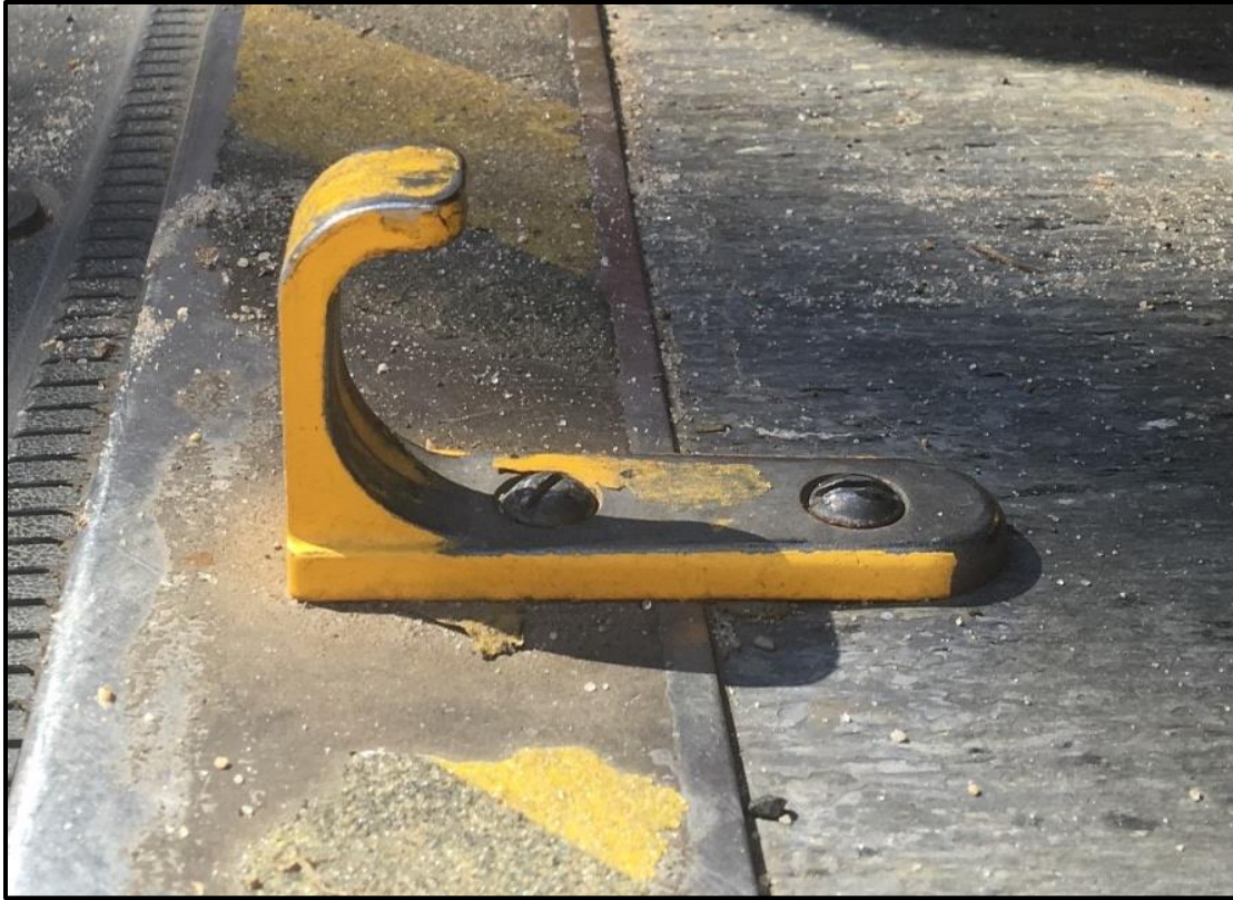
Figure 6. C-shaped safety latch (2016).

Gershon's et al. (1990) findings concur with Goodloe et al. (2012). Goodloe et al. (2012) found that stretcher operations occur in three phases. Each phase represents an opportunity for injuries to occur: