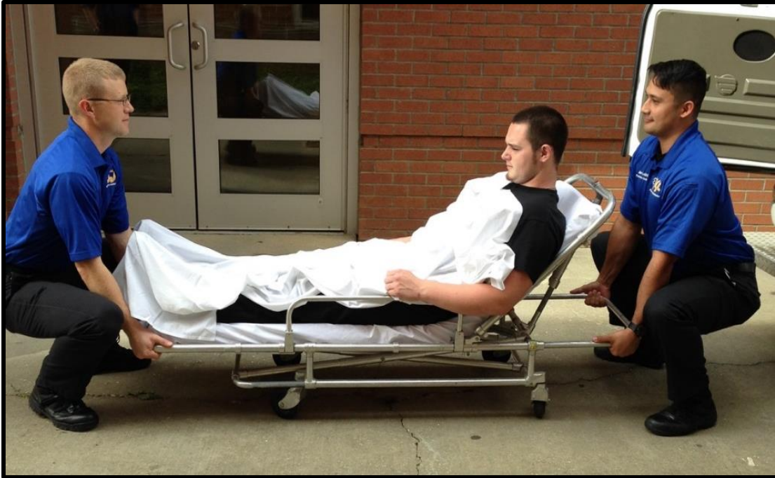
Figure 2. Two medics beginning the manual lift process of the occupied stretcher (2016).