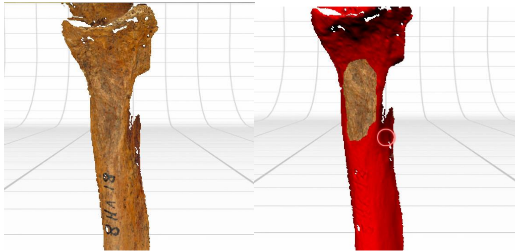
Figure 2. 180° scan of the left ulna before (left) and after (right) selection of bone to be removed for the Brachialis attachment site.

Zumwalt's (2005) method as the files could be more easily transferred from one program to another as compared to other programs. Due to the extensive amount of time involved in this method, only 12 individuals chosen at random for evaluation for this step of the analysis.