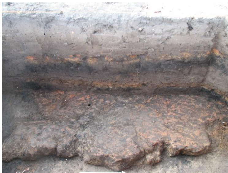
Figure 3 Clay floor from Mound B.

Dr. Jackson has helped, through an examination of the field notes, to identify areas of excavation that may prove particularly fruitful. We picked excavation units and levels that were directly upon or around house floors. The floors were either made of baked clay or the clay was baked by the fire when the structures burned. Figure 3 shows the baked clay floor on the summit of Mound B. The matrix on top of these floors would have contained the microartifacts that were on the floor at the time of destruction or abandonment of the structure.