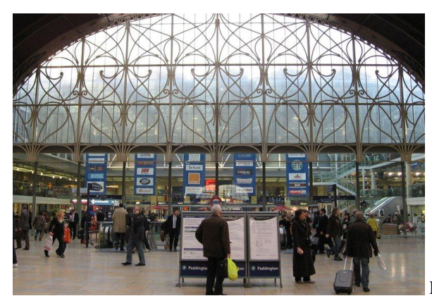
Figure 3: Wrought Iron Pattern Windows<sup>87</sup>