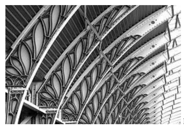
Figure 2: Arched Trusses at Paddington<sup>86</sup>

1851, Brunel specifies that the construction of the interior would be mostly metal and that he would need assistance with the "detail of ornamentation." Wyatt accepted Brunel's offer and consulted Owen Jones, another designer of the imperial courts of the Crystal Palace, in the creation of decorative design elements. Digby and Brunel were responsible for the imperial design that can be found in Paddington Station today. The arched trusses of the train shed are decorated with an arabesque pattern of leaves that can be seen in Figure 2 below. Another example of the imperial design Wyatt implemented is the filigree arabesque designs on the windows at the ends of the station seen in Figure 3.