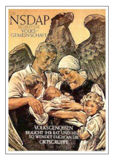
Figure 2.4 (c. 1934) <sup>61</sup>

was issued through the NSDAP's weekly publication, the NS-Frauenswarte newsletter. Bride Schools would become German women's first taste of belonging to the SS.<sup>60</sup>