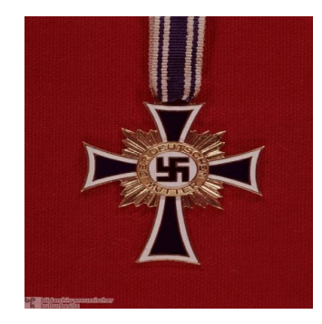
Figure 2.2 Example of "Mother's Cross"<sup>46</sup>

Due to the number of children women were expected to produce, the Nazis enacted a policy of Gesundheitspflicht, or "the duty to be healthy." Women were expected to maintain their health to bore healthy German children. They were not permitted to be skinny, this was seen as unhealthy, and smoking was highly discouraged; so much so in fact, that the League of German Girls, a Nazi organization, circulated antismoking propaganda. Figure 2.3 is an example of Nazi propaganda geared towards women to discourage tobacco and alcohol. The script on the image translates to "Motherhood, soft cider, and Volkswagens: virtues of abstinence include healthy infants and savings, enough to buy two million Volkswagens." To further protect women's health, the Nazis implemented several Occupational Protections for Women, Children, and the unborn in Germany from 1933-1945. These protections included such things as height restrictions for female streetcar operators and banning pregnant women from work