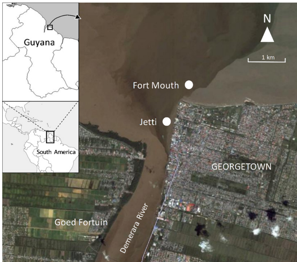
FIGURE 1. Satellite image showing approximate location of the study sites in the Demerara River estuary, Guyana. The fishing pens at Fort Mouth and Jetti were where the monitored Chinese seines were set, and the fishing village of Goed Fortuin from which the Chinese seine vessel operated are shown. Insert maps show location of Guyana in South America, and of the Demerara River in Guyana.

the ‘retained catch’ (comprising mostly shrimp with a few large finfish), the ‘finfish discards’ (all finfish to be thrown back), and ‘other discards’ (miscellaneous invertebrates to be thrown back). A sub-sample of finfish discards (representing about 5% by weight) was taken from each haul, prior to throwing them overboard. Thereafter, each fish specimen was individually