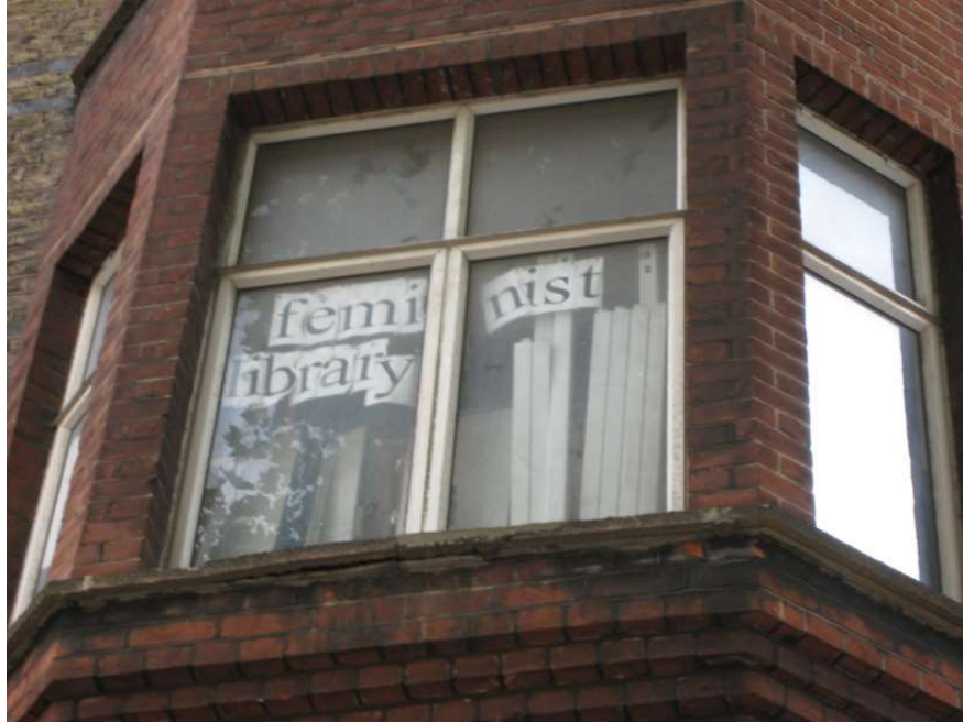
Figure 1. Outside of the Feminist Library